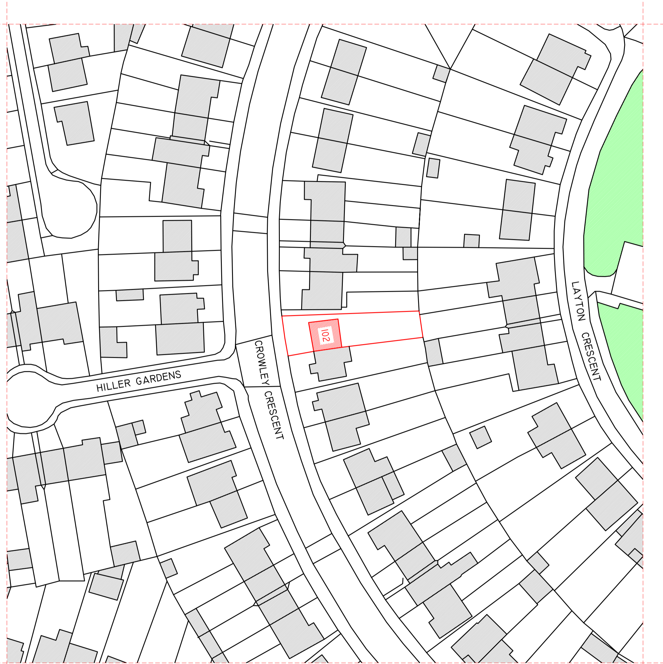
BLOCK PLAN OF THE SITE, PROPOSED PLAN, SCALE 1:500