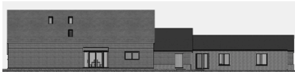
Indicative Image 01.

AS PER INDUSTRY STANDARDS, YOU ARE STRONGLY ADVISED NOT TO ORDER YOUR WINDOWS FROM THE DRAWINGS, BUT TO ACTUALLY MEASURE THE STRUCTURAL OPENINGS ON SITE