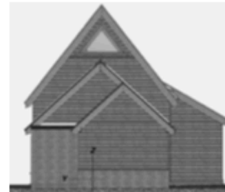
Indicative Image 02.