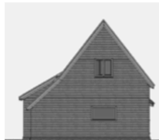
Indicative Image 05.