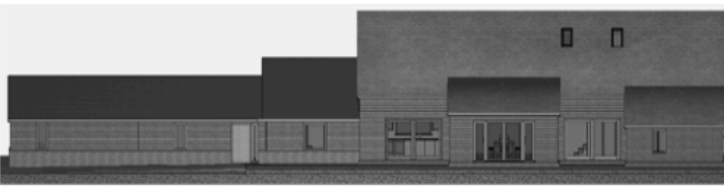
Indicative Image 04.