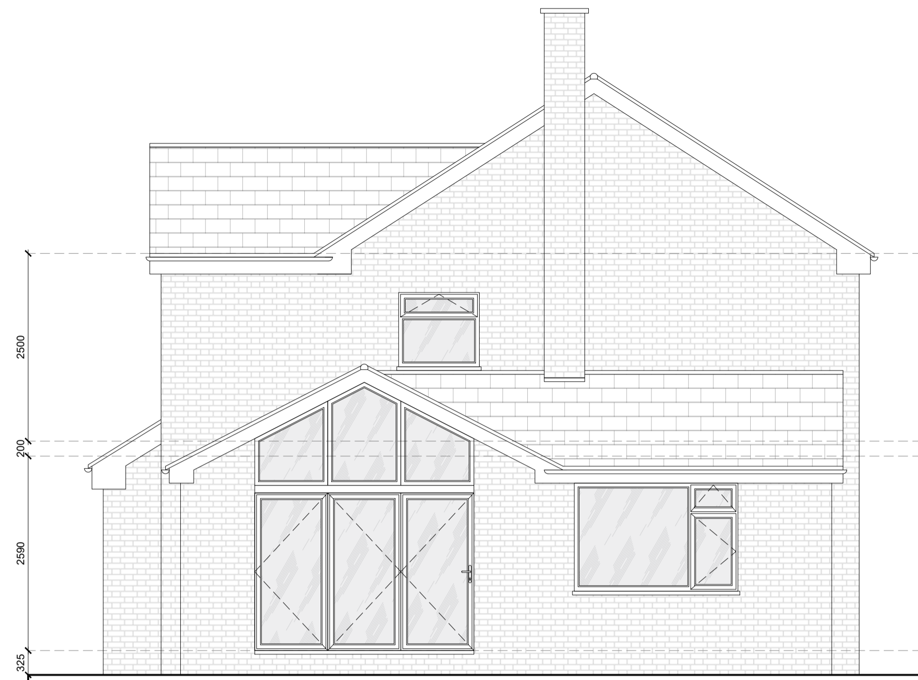
EXISTING RIGHT SIDE ELEVATION SCALE 1:50