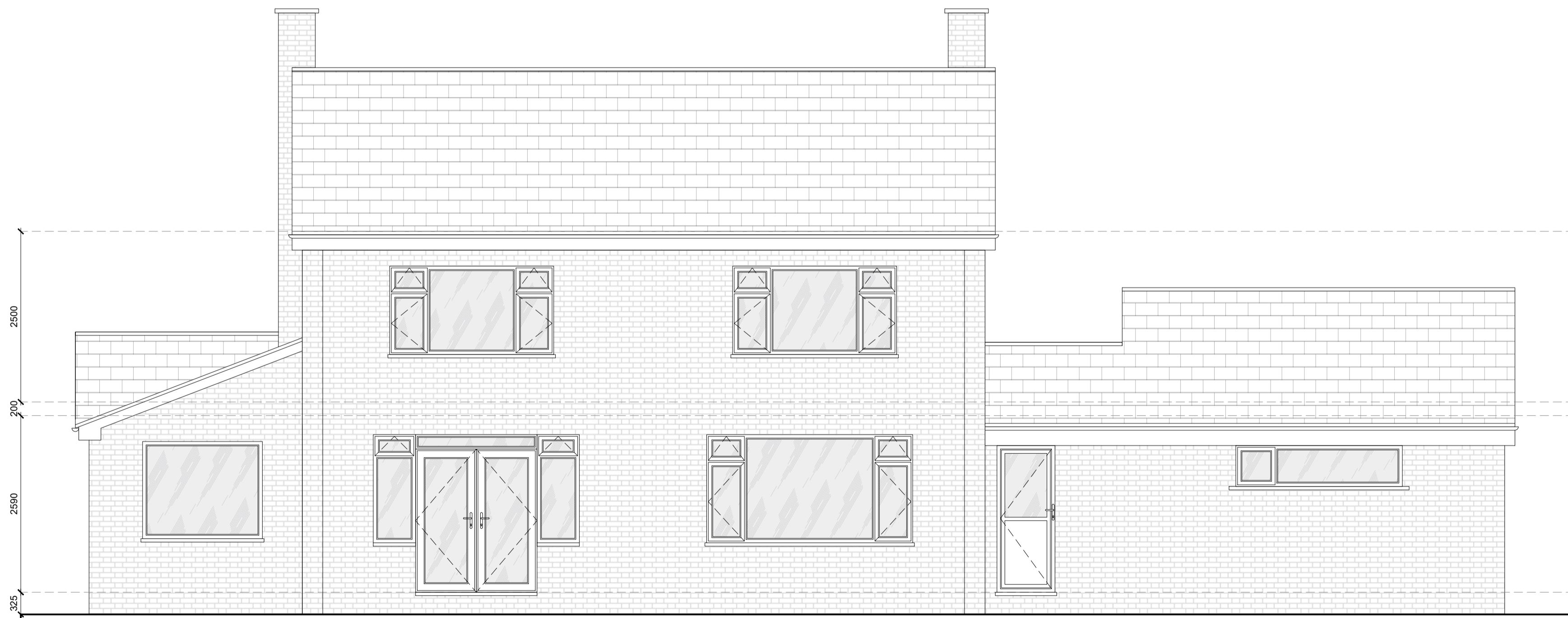
EXISTING REAR ELEVATION SCALE 1:50