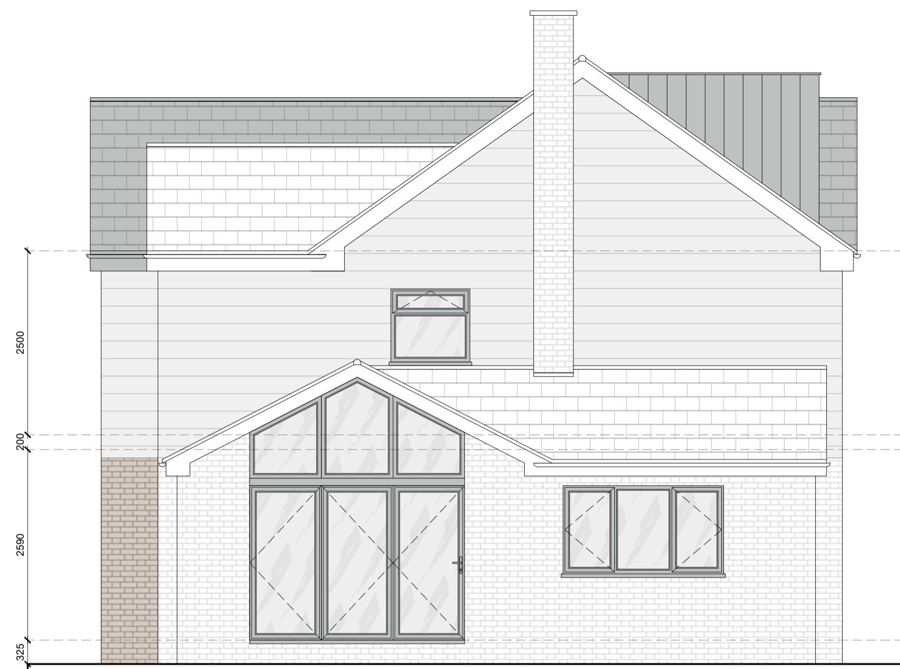
PROPOSED RIGHT SIDE ELEVATION SCALE 1:50