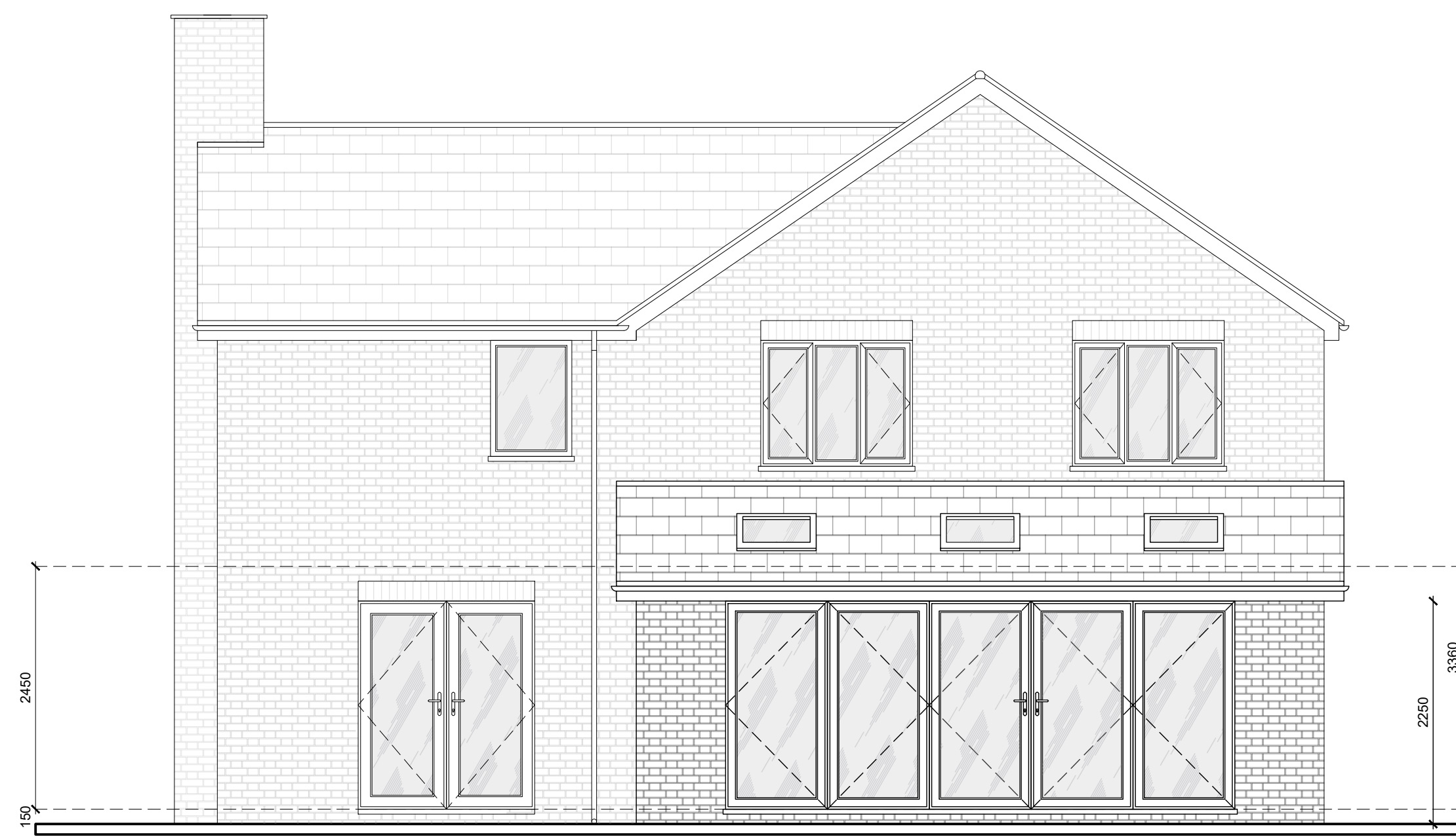
PROPOSED RIGHT SIDE ELEVATION SCALE 1:50