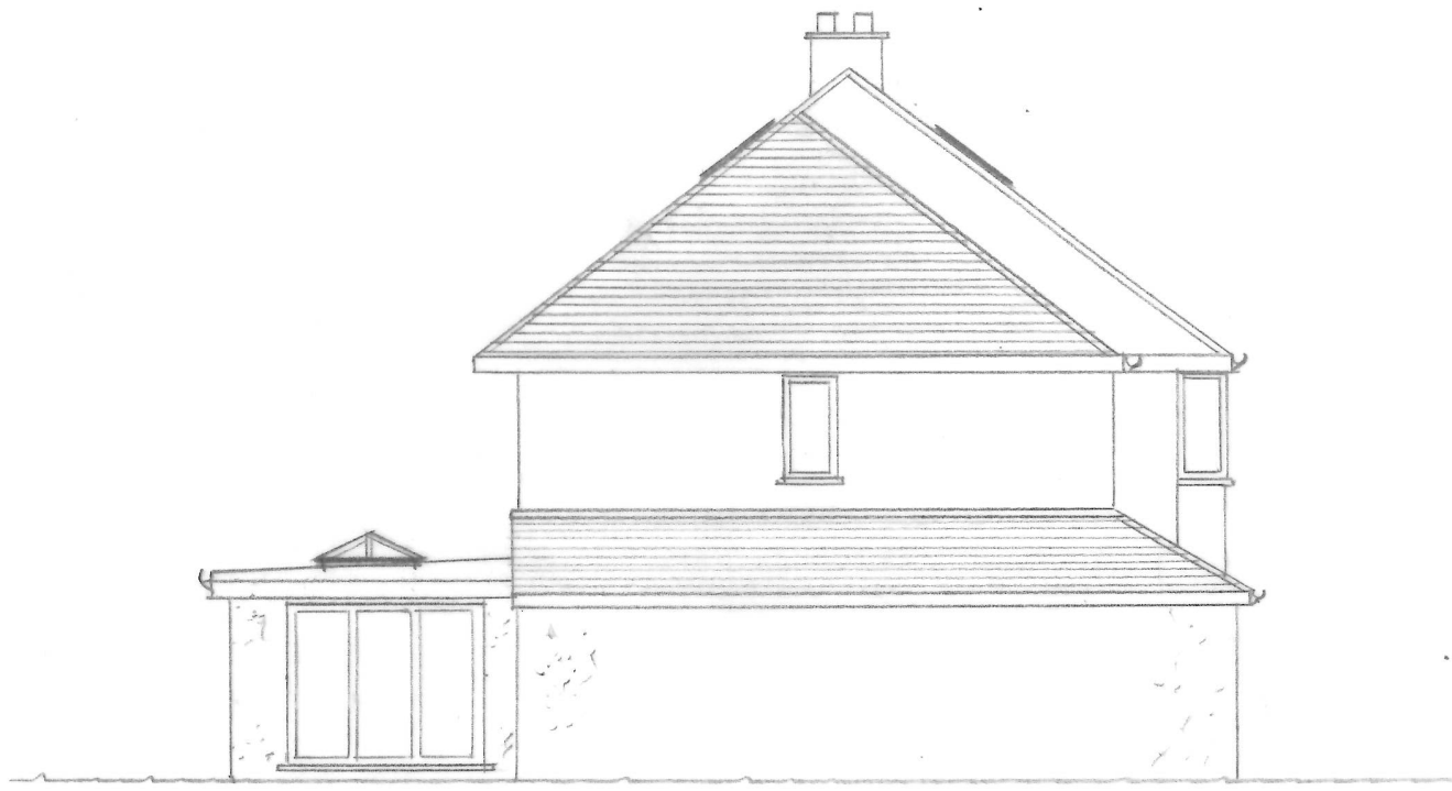
PROPOSED SIDE ELEVATION (2)