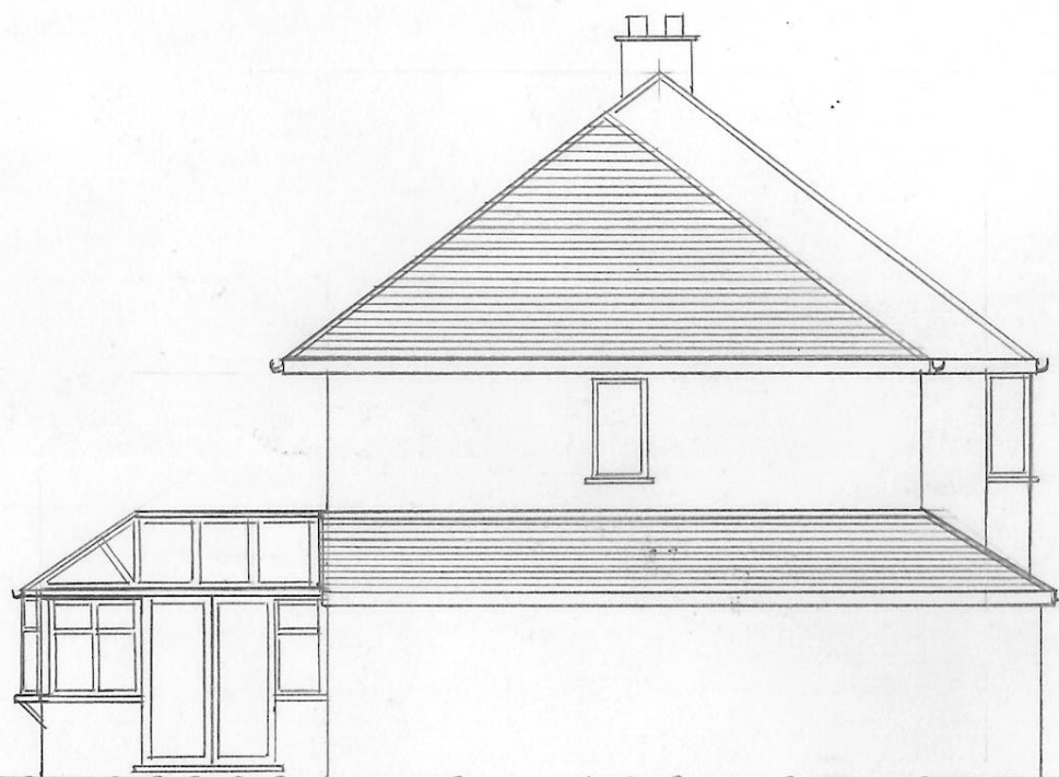
EXISTING SIDE ELEVATION (2)