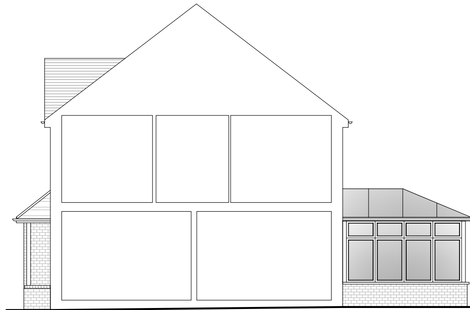
8 Existing Side Section