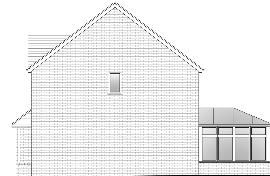
7 Existing Side Elevation