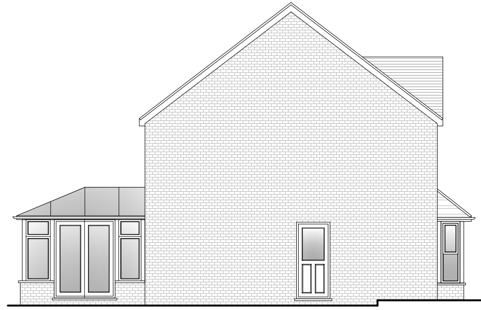
5 Existing Side Elevation