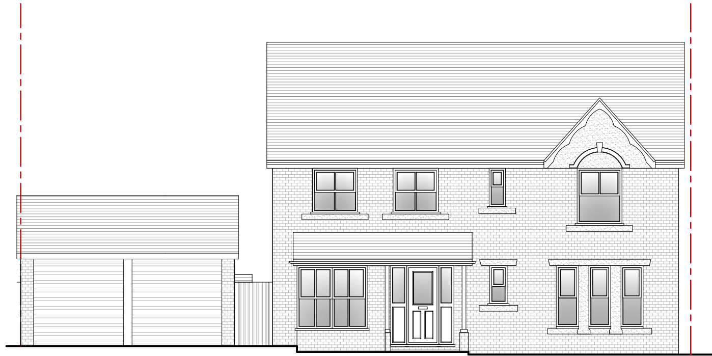
4 Existing Front Elevation