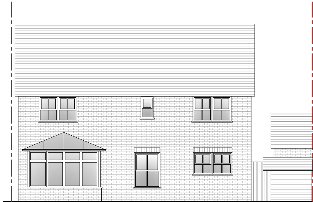
6 Existing Rear Elevation