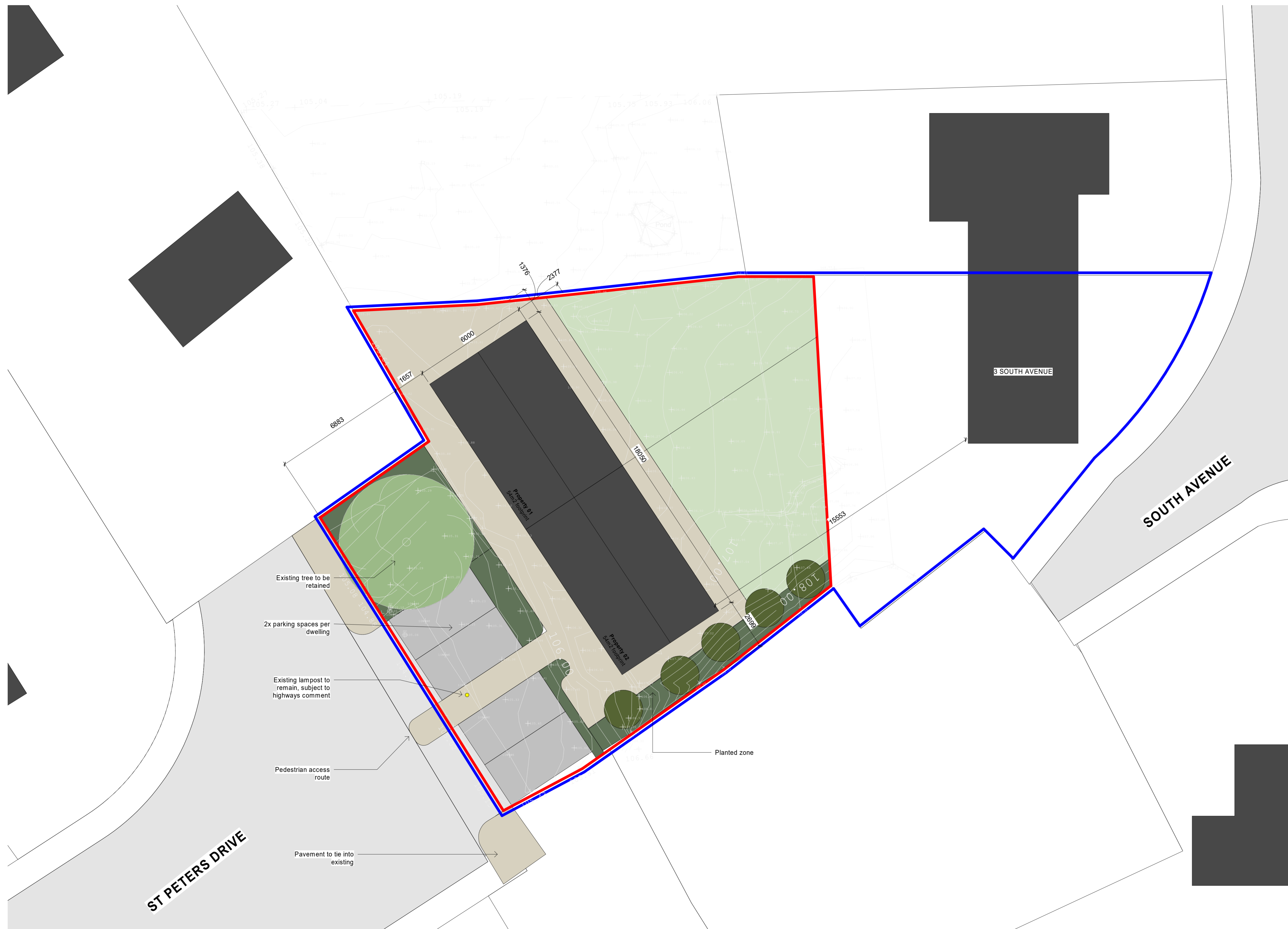
Proposed Site Plan 1 : 100

This drawing is copyright and may not be copied or reproduced without the written consent of JRM Architectural. The contractor is responsible for all setting-out and must check all dimensions and levels prior to work being put in hand. The drawing should not be scaled, Only written dimensions are to be taken for this project. The designer is to be immediately notified of any suspect omissions or discrepancies.