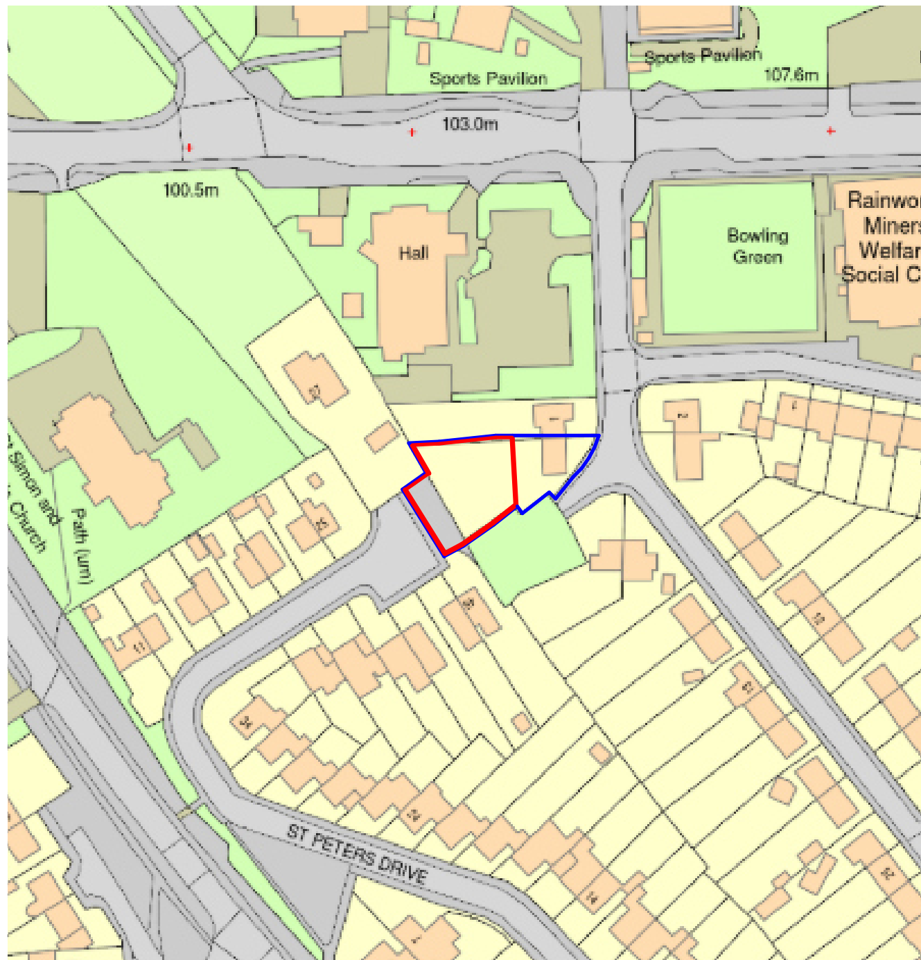
Existing Location Plan - 1-1250 1 : 1250