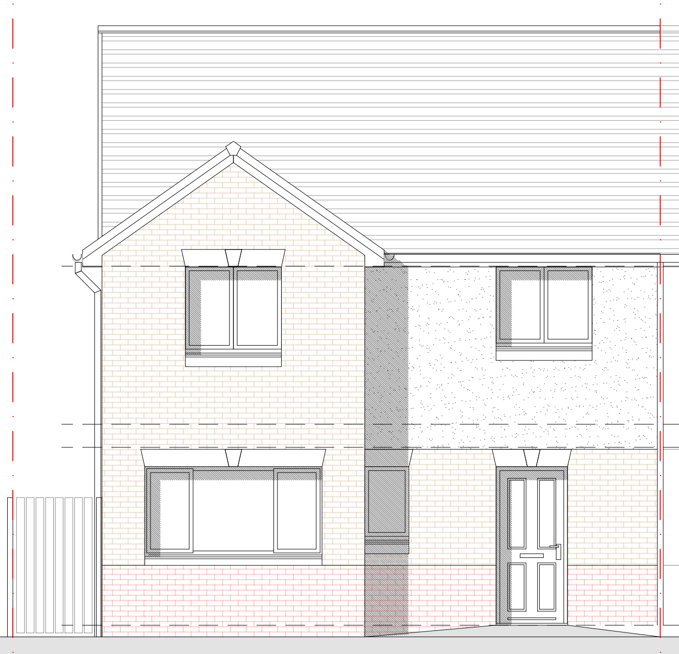
Proposed North Elevation - UNCHANGED 1:50 @ A3