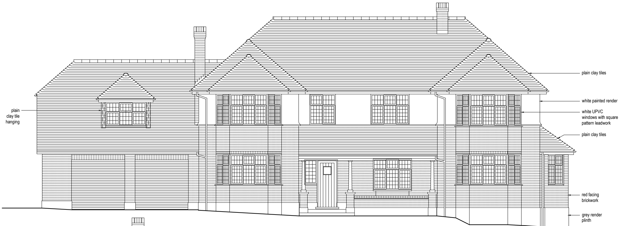
FRONT ELEVATION south face