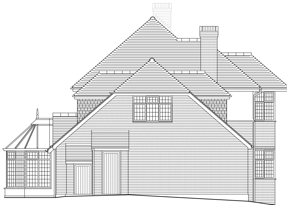
SIDE ELEVATION west face