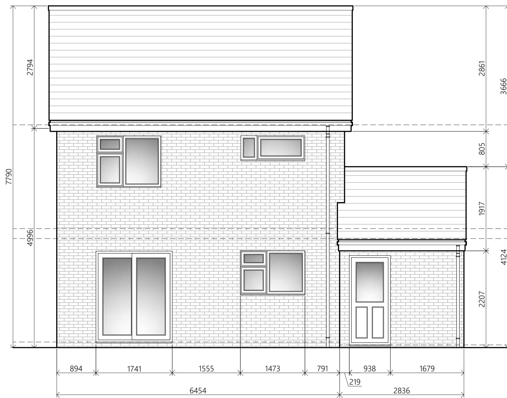
EXISTING REAR ELEVATION SCALE 1:50