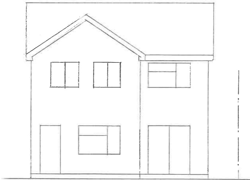
EXISTING REAR ELEVATION - E