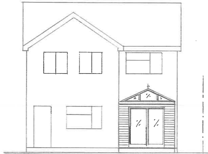
PROPOSED REAR ELEVATION - E