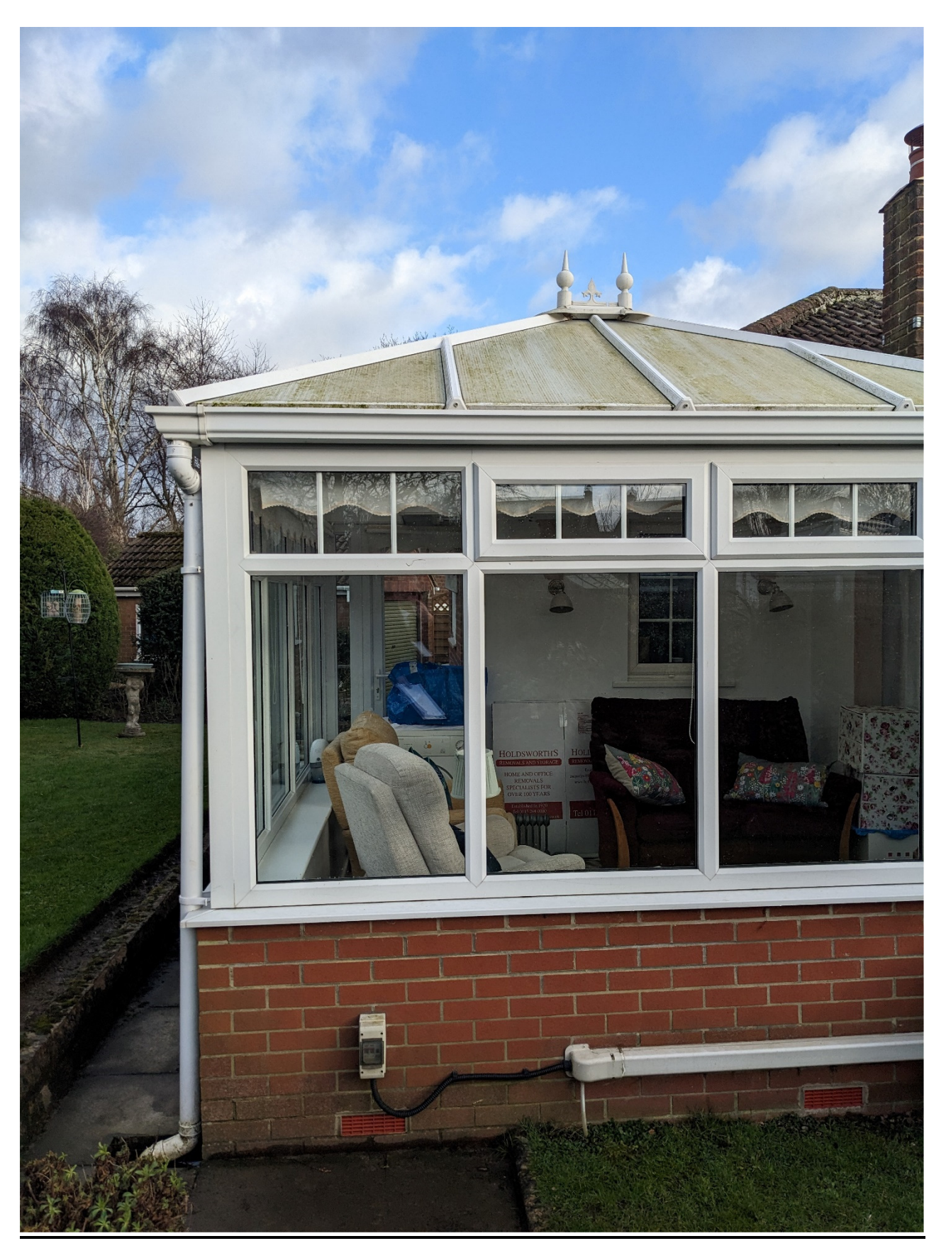
Modern Conservatory to Side/ Rear