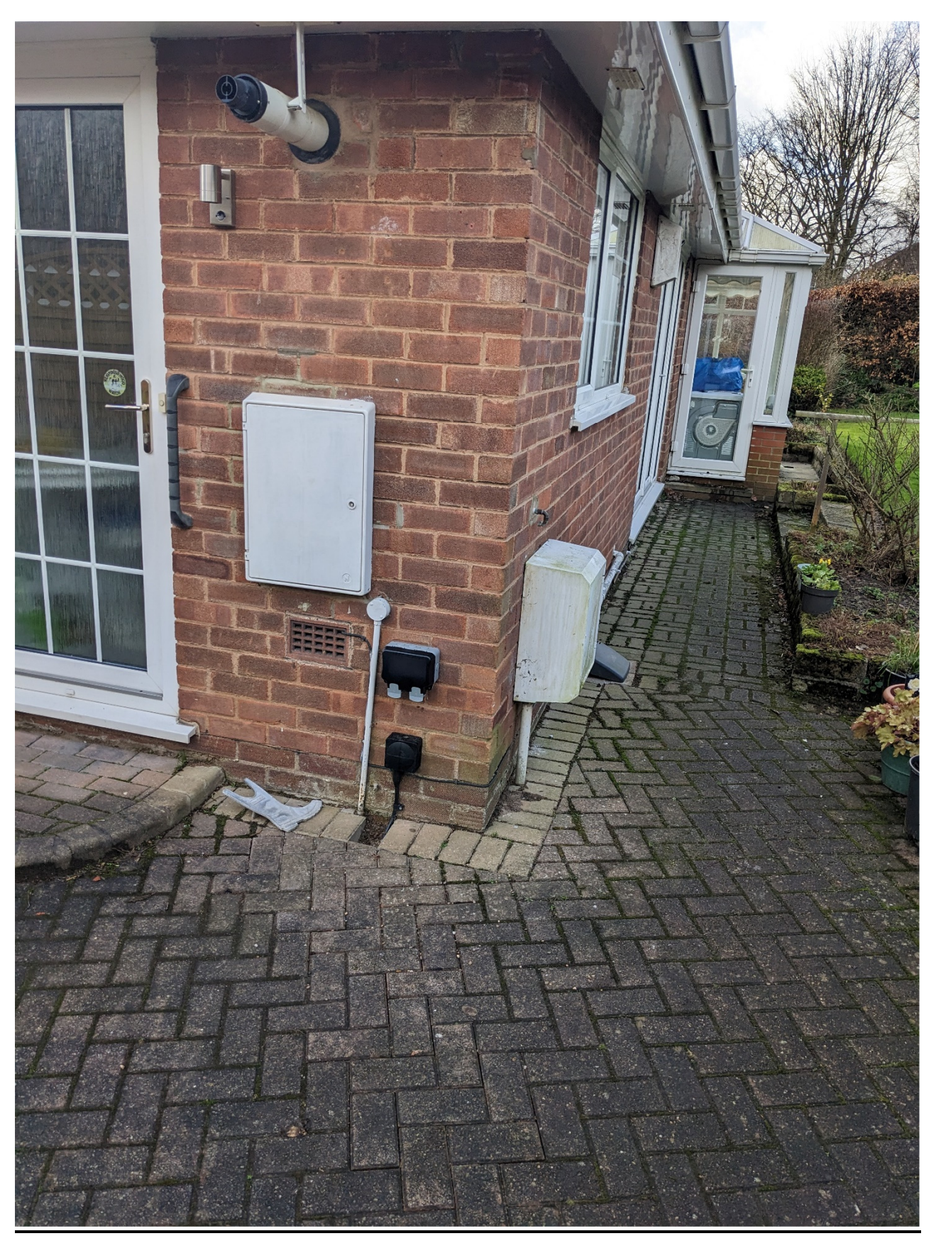
Rear Corner Elevation Showing Sealed Eaves & Modern Detailing