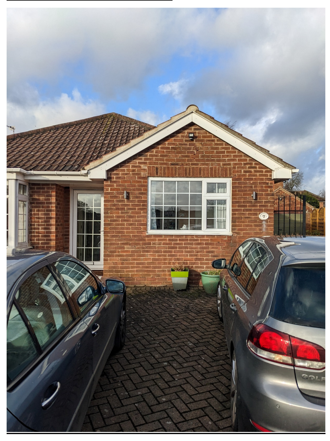
Frontage Showing Modern Roof & Materials