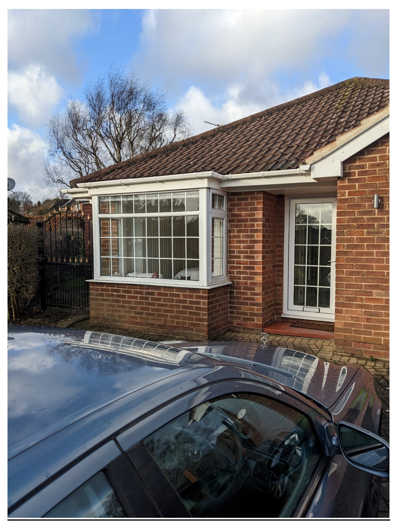
Front External Corner Showing Modern Windows & Sealed Eaves