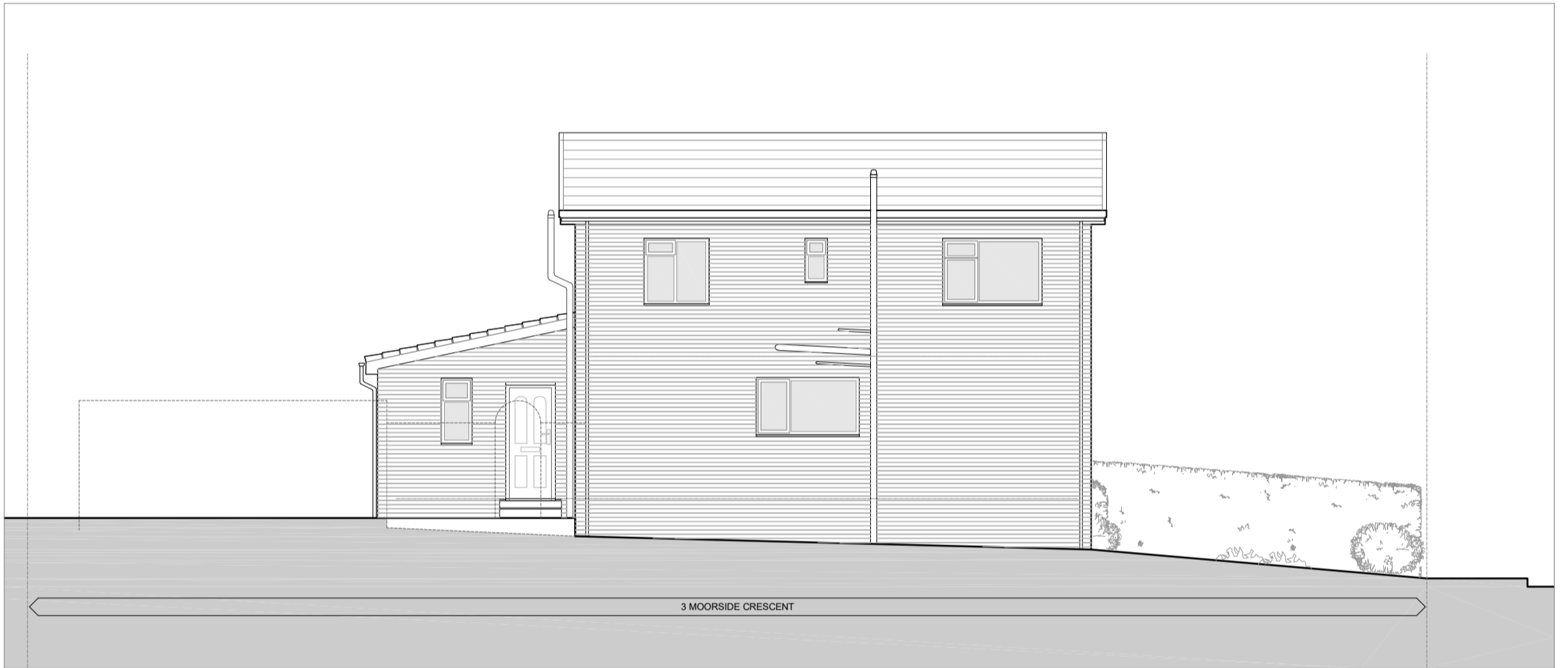
WEST (SIDE) ELEVATION - 1:100