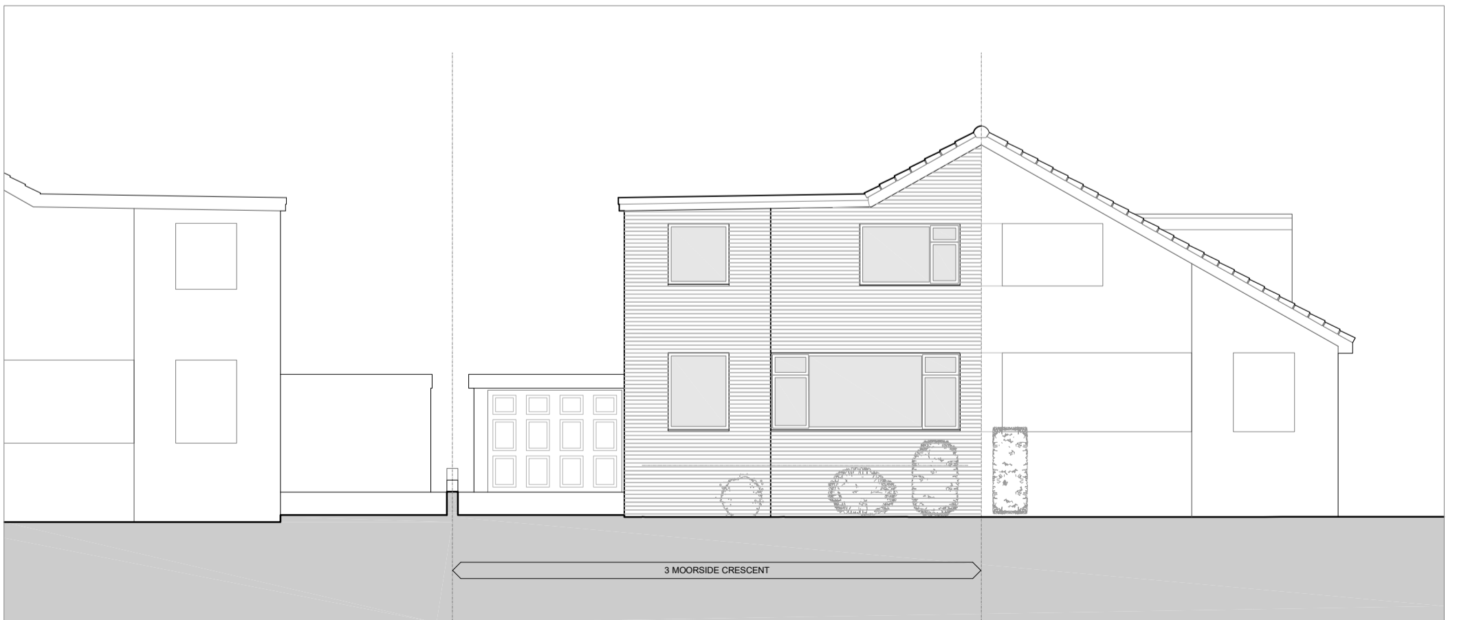
SOUTH (FRONT) ELEVATION - 1:100