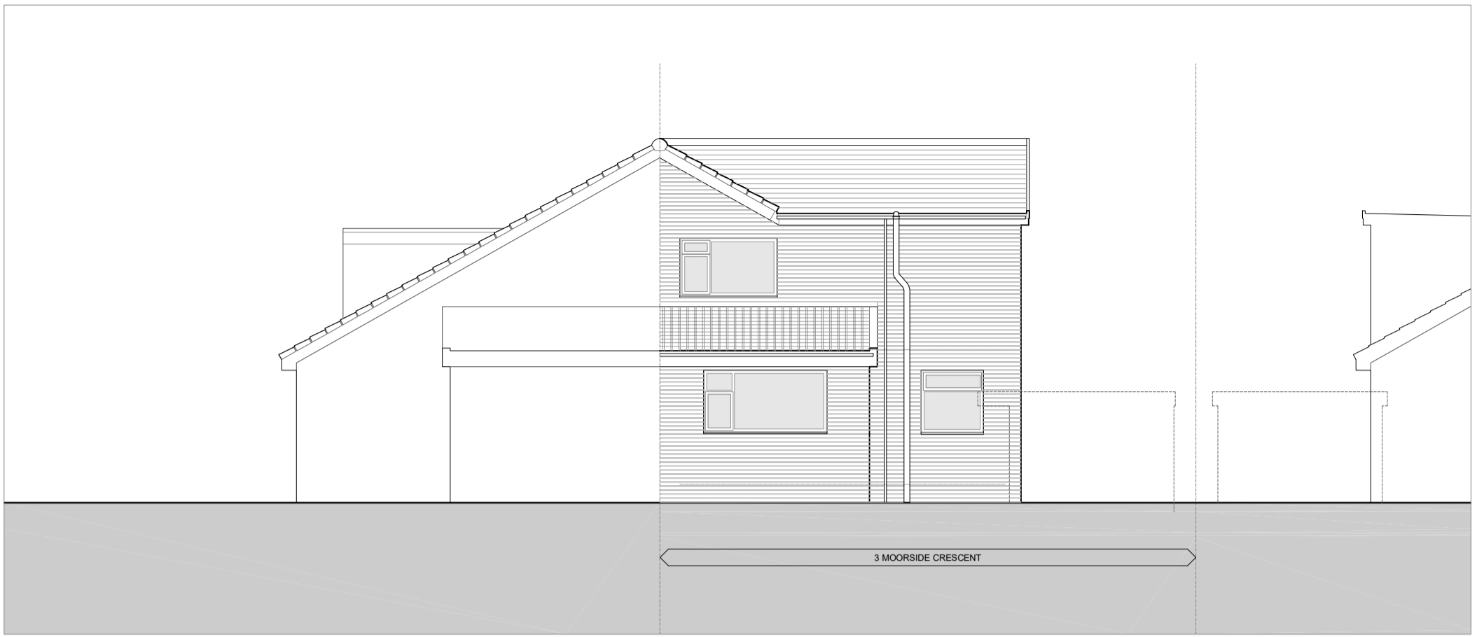
NORTH (REAR) ELEVATION - 1:100