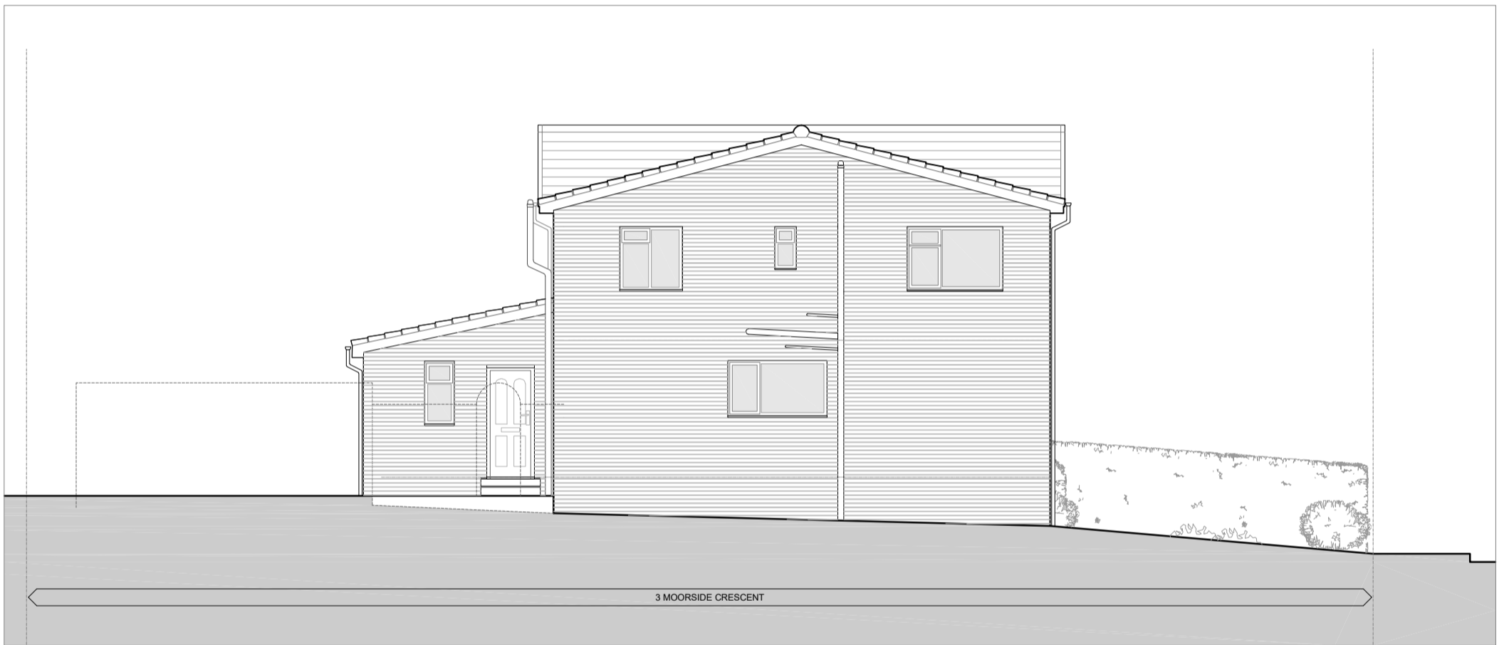
WEST (SIDE) ELEVATION - 1:100