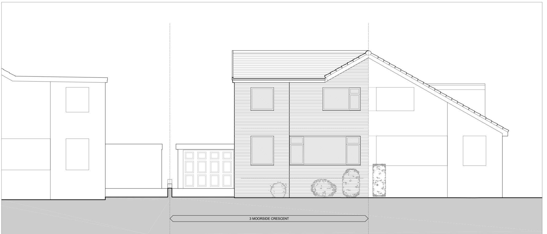
SOUTH (FRONT) ELEVATION - 1:100