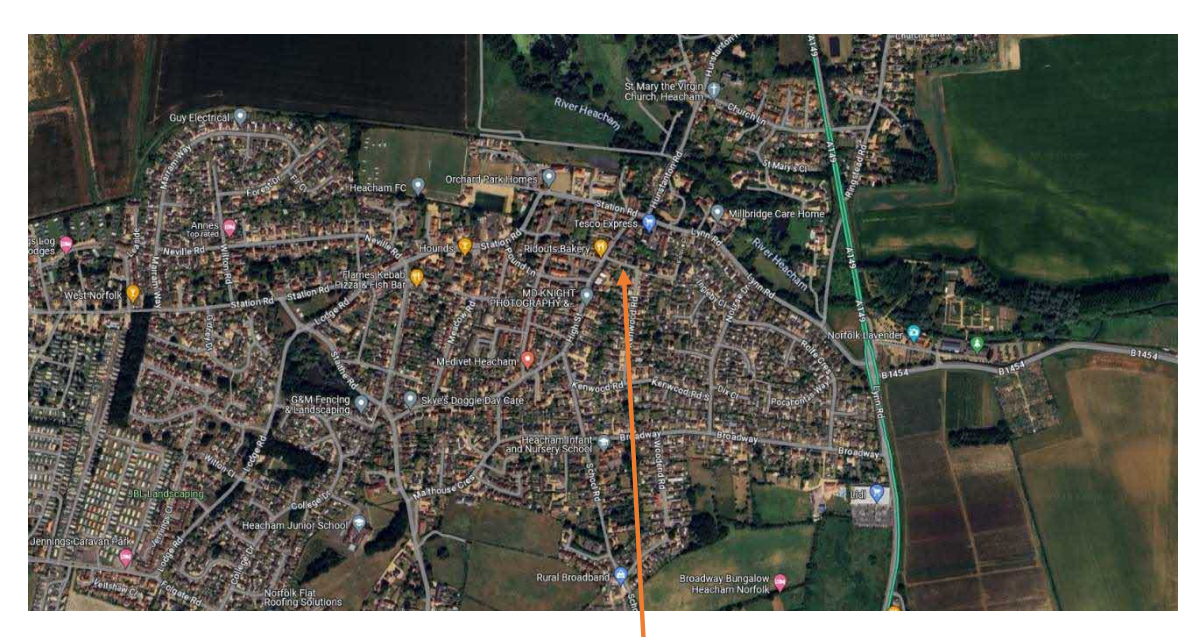
SITE 1 KENWOOD ROAD