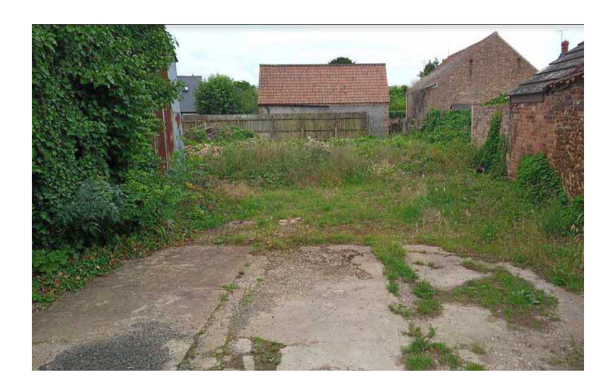
Entrance from Kenwood Road