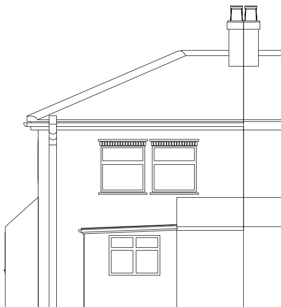
EXISTING REAR ELEVATION NORTH EAST