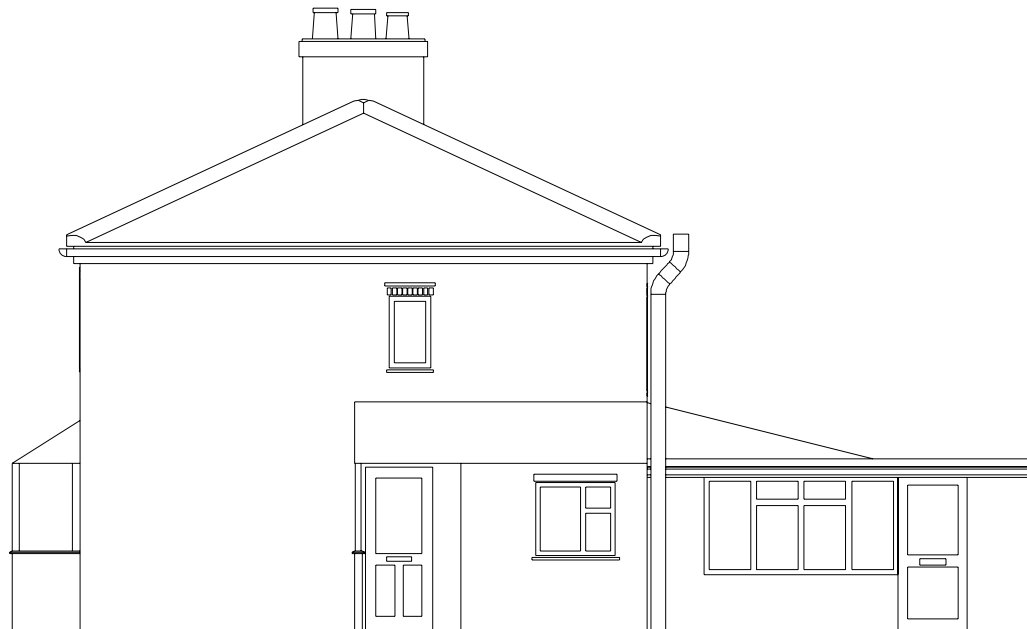
EXISTING SIDE ELEVATION SOUTH EAST