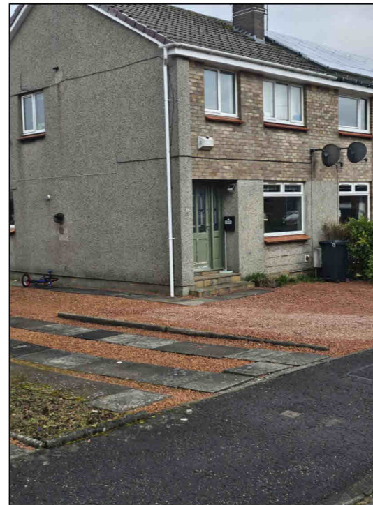
Existing Gable Elevation

This copy has been made by or with the authority of Midlothian Council pursuant to Section 47 of the Designs and Patents Act 1988. Unless that Act provides a relevant exception to copyright, the copy must not be copied without the prior permission of the copyright owner.