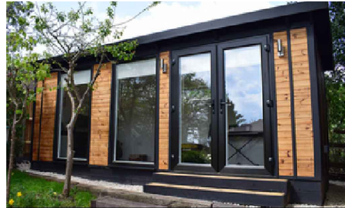
OUTBUILDING B NEW - SUMMER HOUSE 3.2m (w) x 3.7 (l) x 2.4m (h)