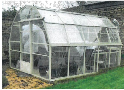
OUTBUILDING A EXISTING (RELOCATING) 3.1m (w) x 3.8m (l) x 2.4m (h)