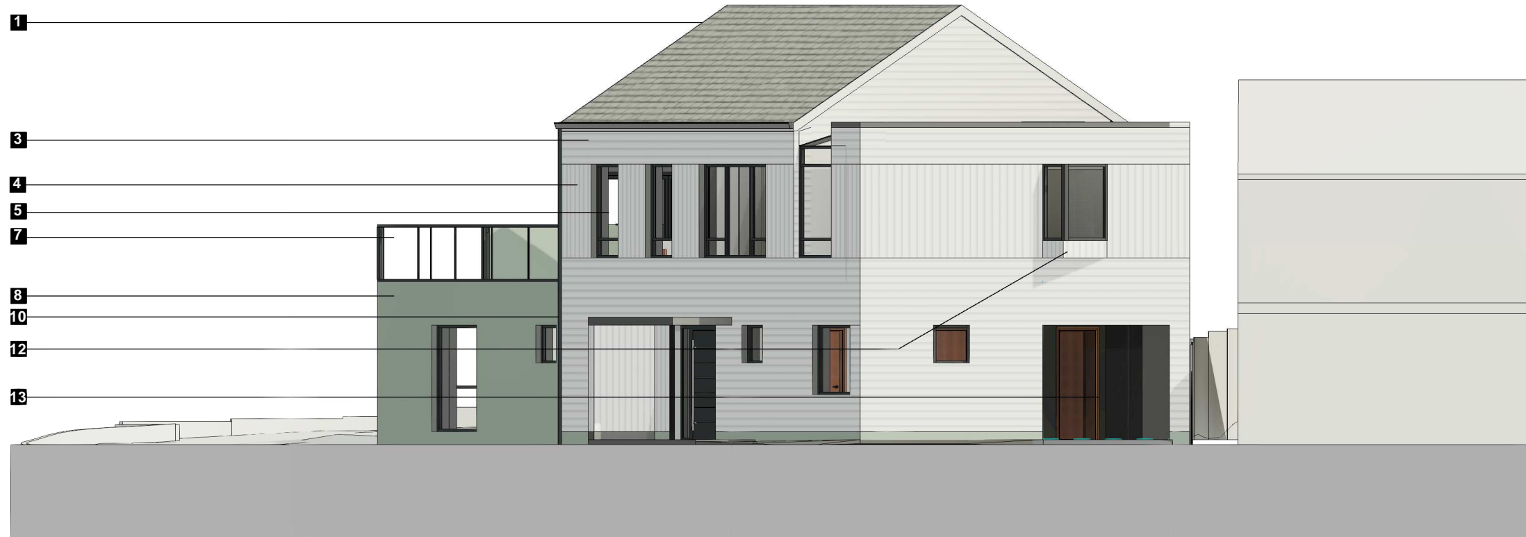
1 North-West Elevation Scale: 1 : 100

PROJECT | AUTHOR | ZONE | LEVEL | TYPE OF INFO | ROLE | NUMBER