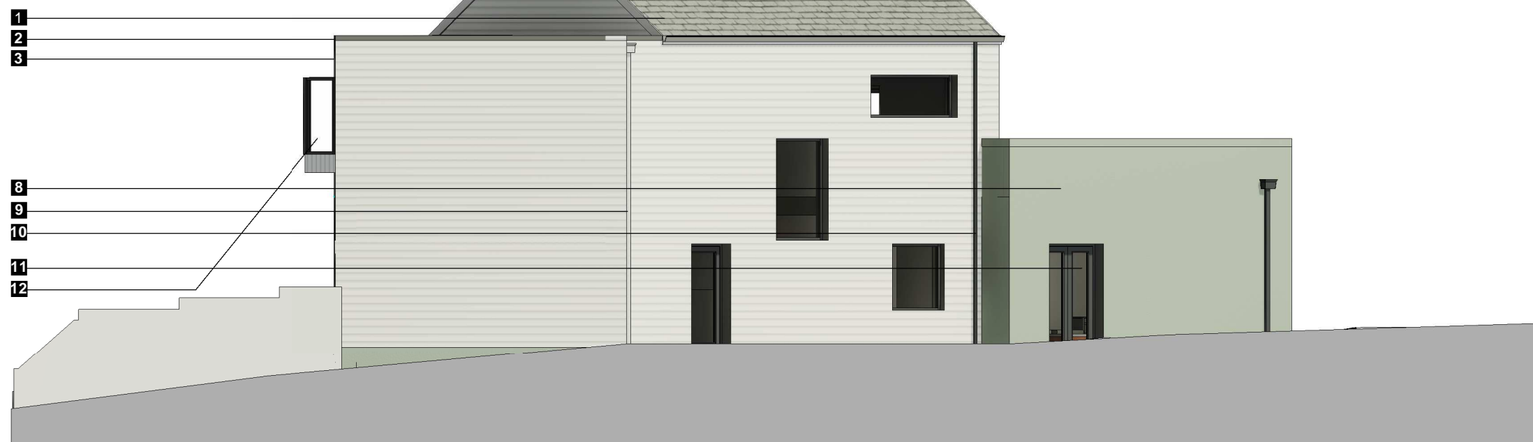
2 South-West Elevation Scale: 1 : 100