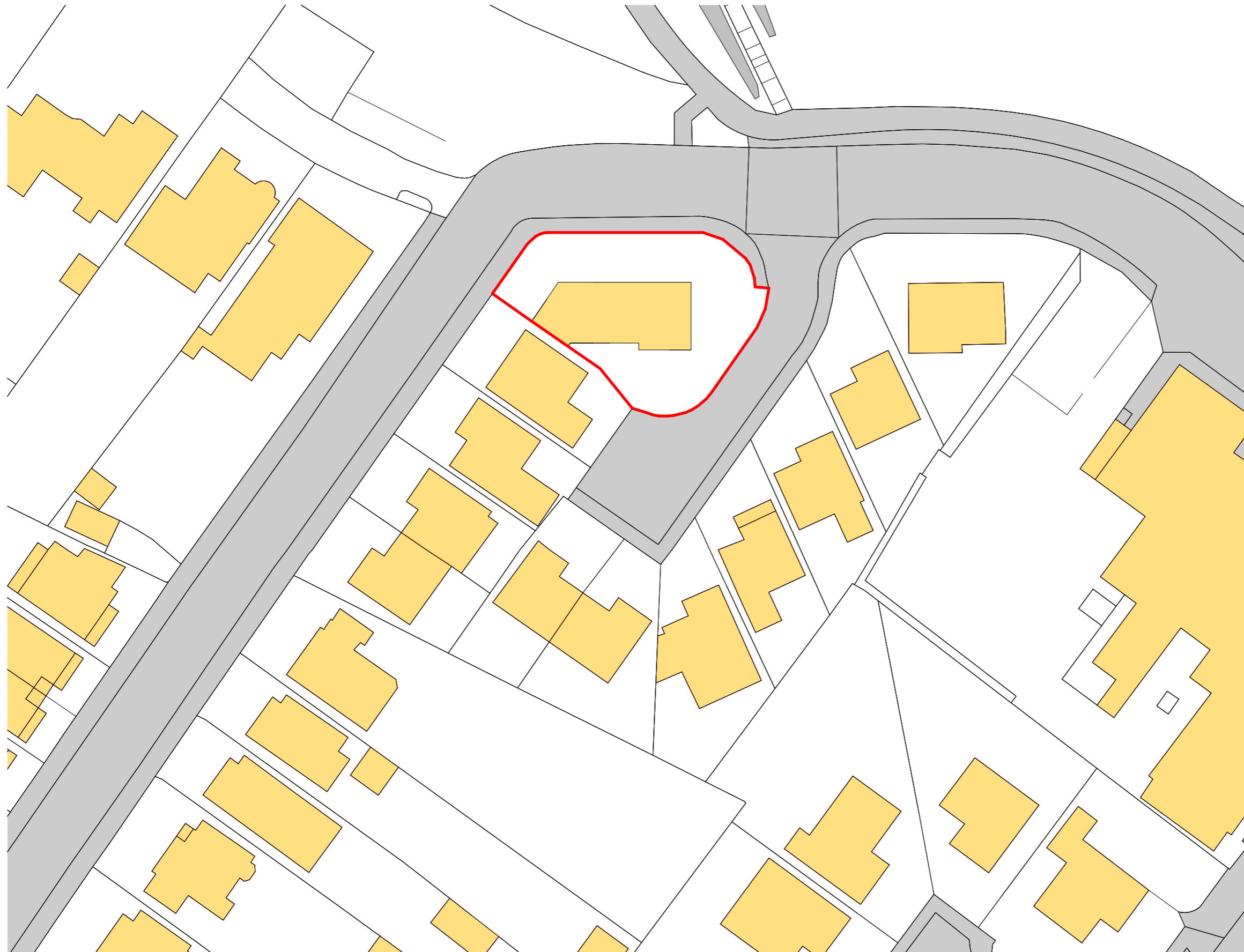
1 Proposed Block Plan Scale: 1 : 500

© DO NOT SCALE DRAWING Lee Evans Partnership LLP own the copyright of this and any associated documents. Such documents may not be used or reproduced for any purpose other than that for which they were created.