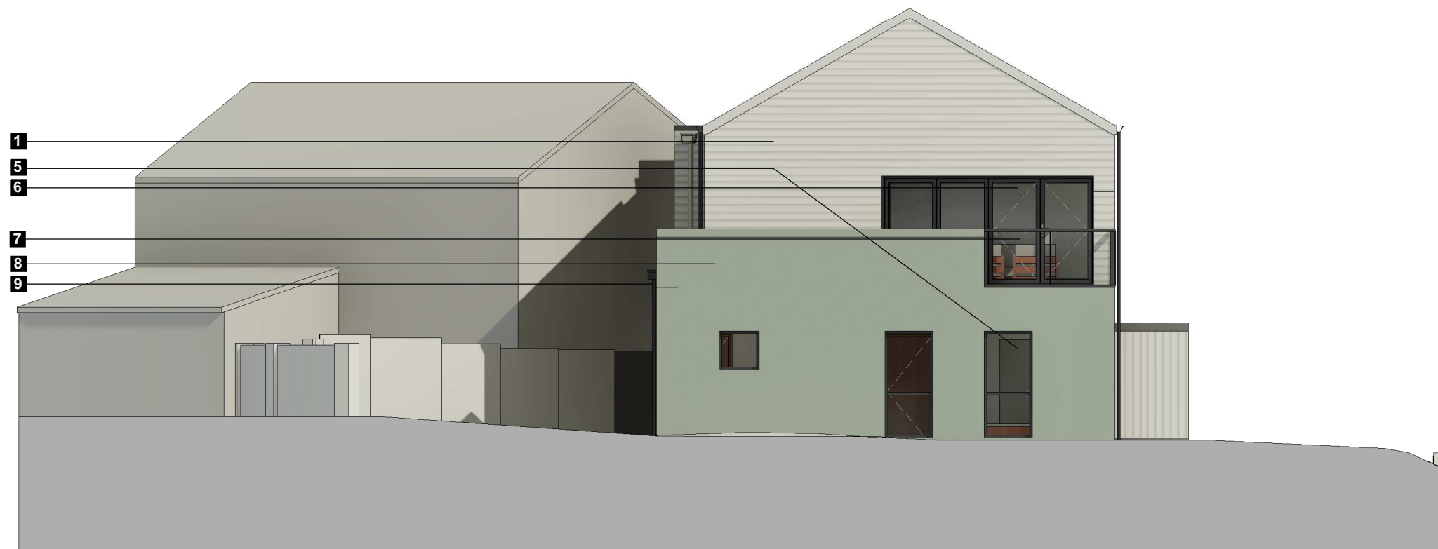
1 East Elevation Scale: 1 : 100

PROJECT | AUTHOR | ZONE | LEVEL | TYPE OF INFO | ROLE | NUMBER