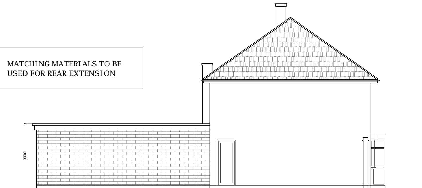
PROPOSED OTHER SIDE ELEVATION

MATCHING MATERIALS TO BE USED FOR REAR EXTENSION