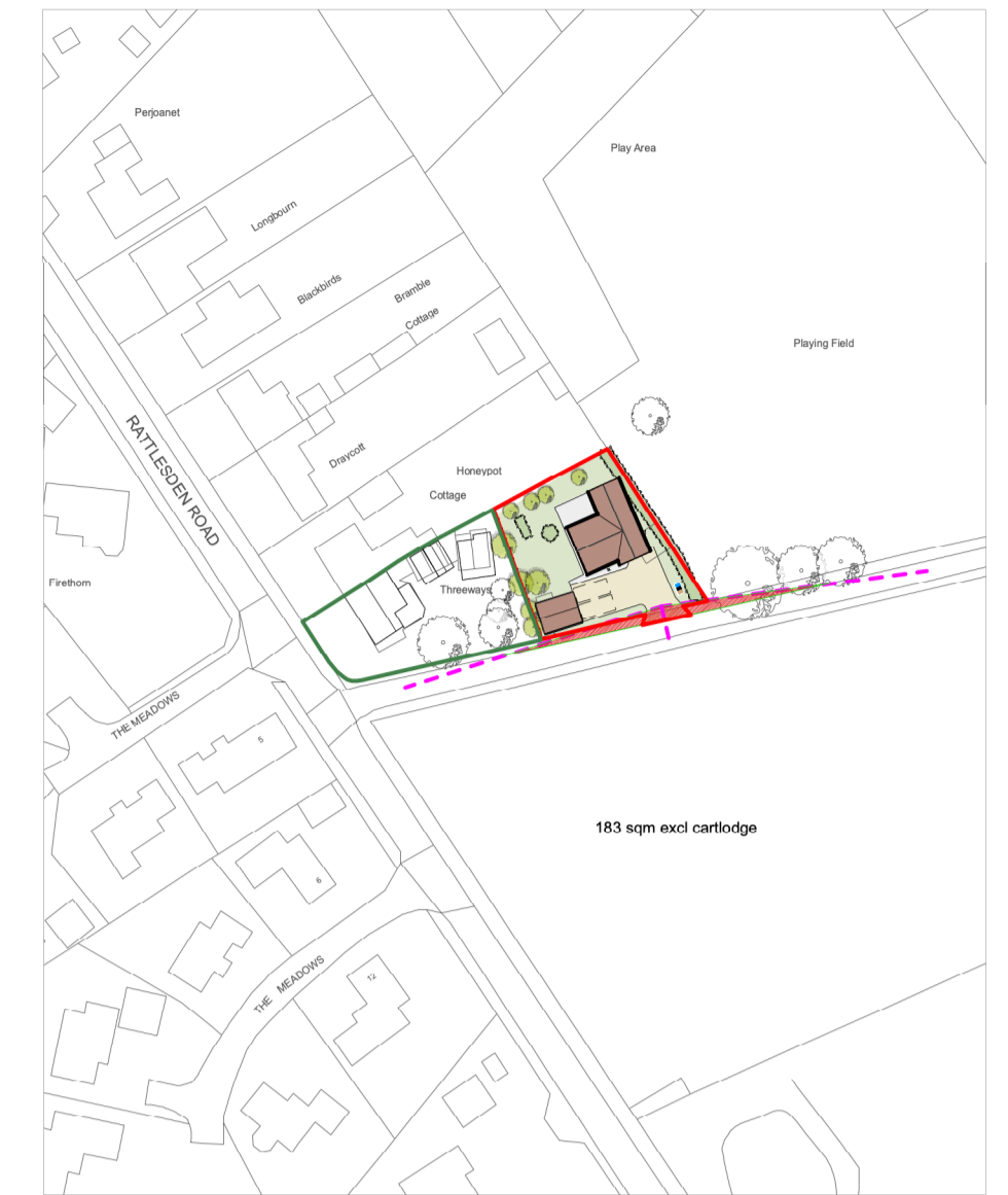
1 Proposed Location Plan Scale: 1:1250