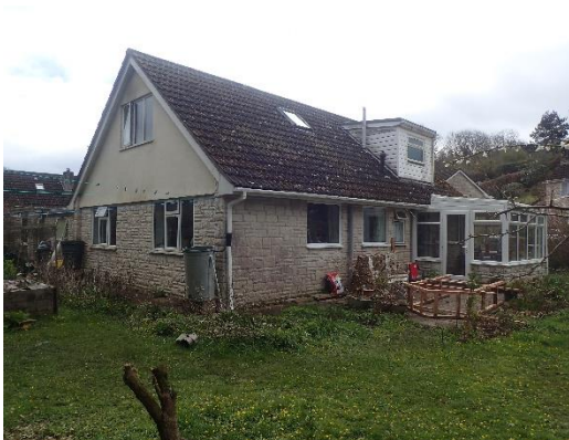
Figure 4. The property viewed from the northwest