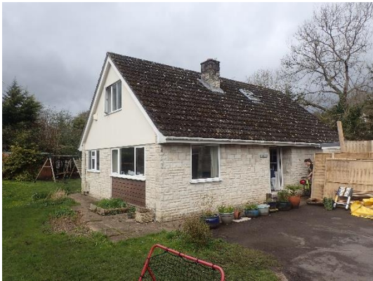
Figure 2. The property viewed from the southeast