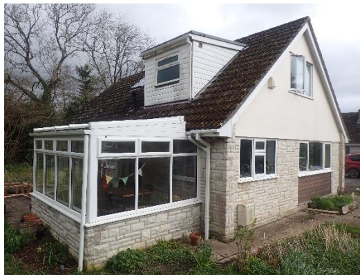
Figure 5. The property viewed from the southwest