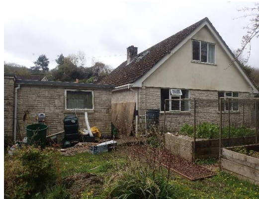
Figure 3. The north elevation of the property and garage