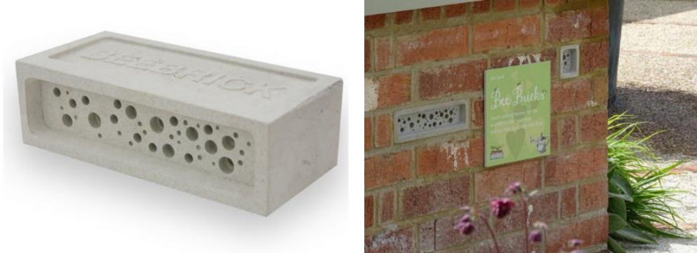
Bee Brick - case in concrete: 215mm x 105mm x 65mm http://greenandbluebuild.co.uk/product/bee-brick/

Bee bricks to be positioned within southerly elevations, which includes part or full sun, between 1m to 2m above ground level, and ideally facing garden or boundary habitats.