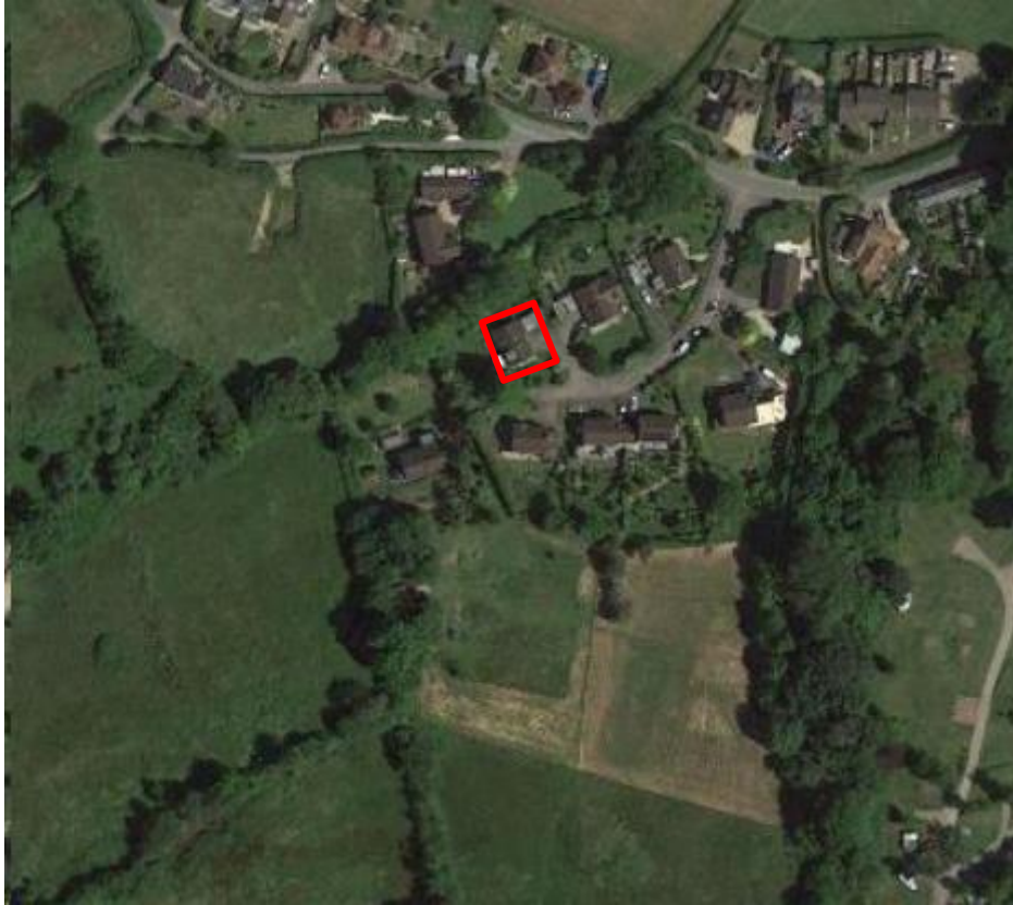
Figure 1. The location of Littlebrook outlined in red