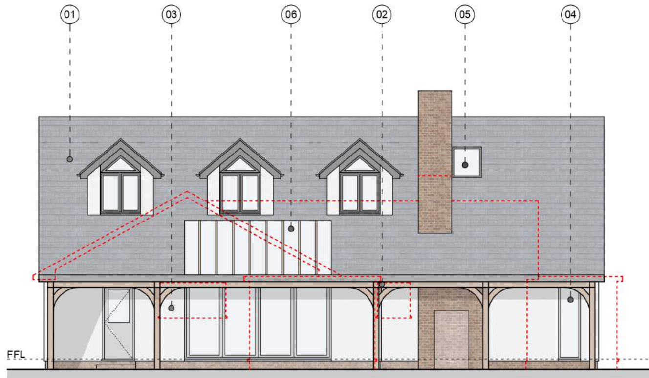
Proposed North West Elevation