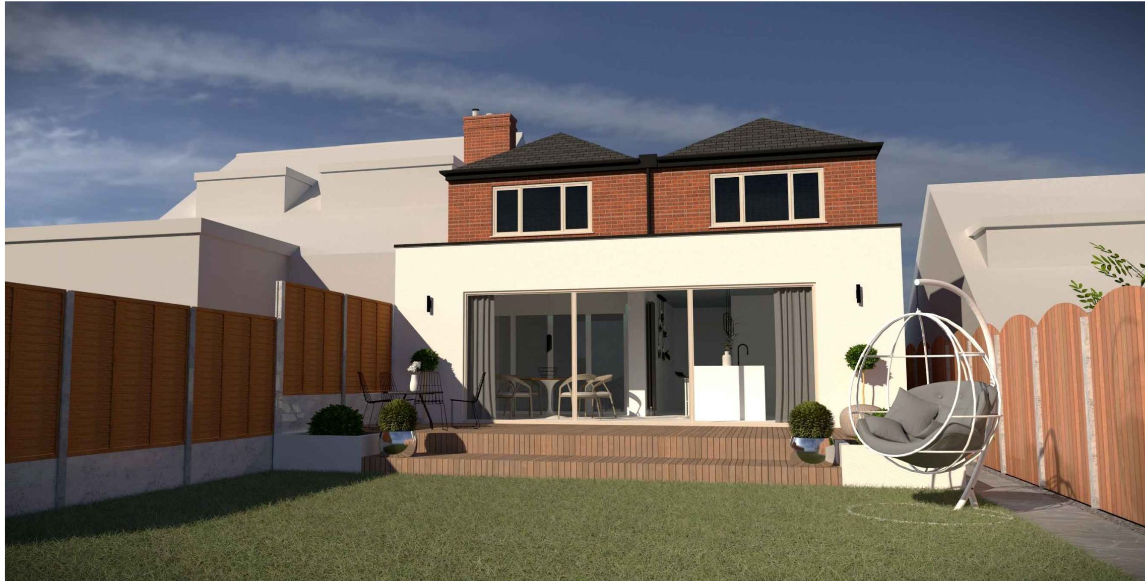
Proposed Rear Visual scale NTS@A3 FOR ILLUSTRATIVE PURPOSES ONLY