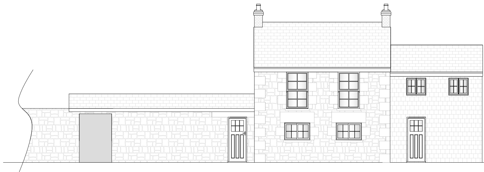
Proposed Front Elevation (North)

Contractors must check all dimensions on site. Only figured dimensions are to be worked from. Discrepancies are to be reported immediately.