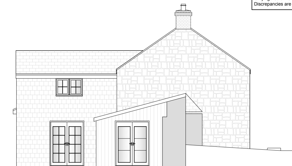
Proposed Side Elevation (East)