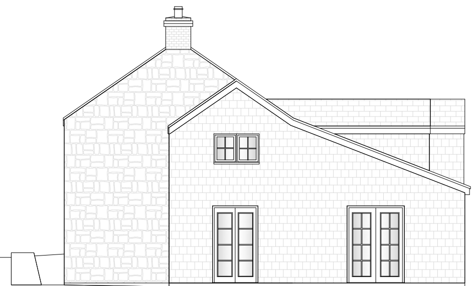
Proposed Side Elevation (West)