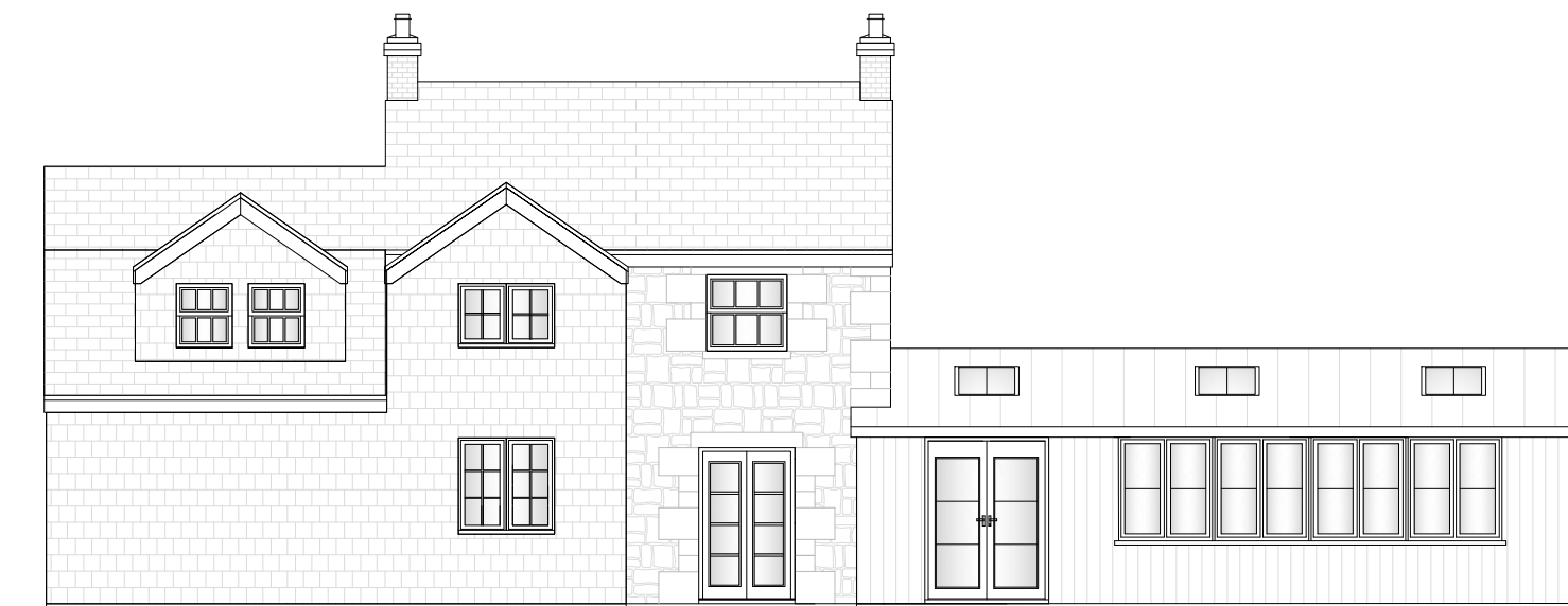
Proposed Rear Elevation (South)