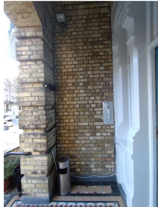
Electrical supply from clients Flat to scooter charging point