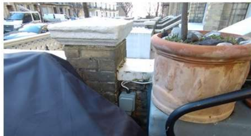
Scooter charger point