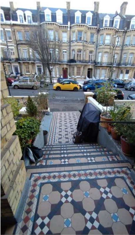
View down Communal steps