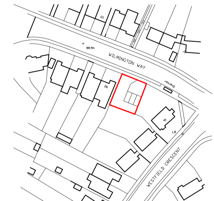
Location plan 1:1250