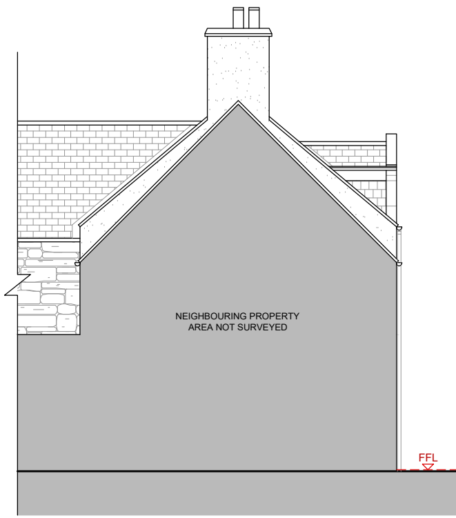
NORTH GABLE ELEVATION