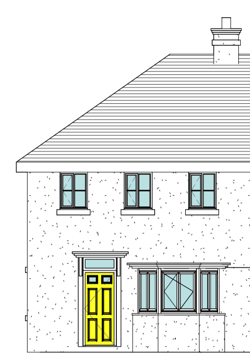
East Elevation - Proposed 1 : 100