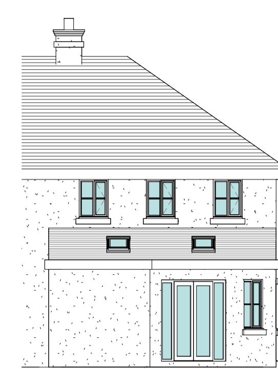
West Elevation - Proposed 1 : 100