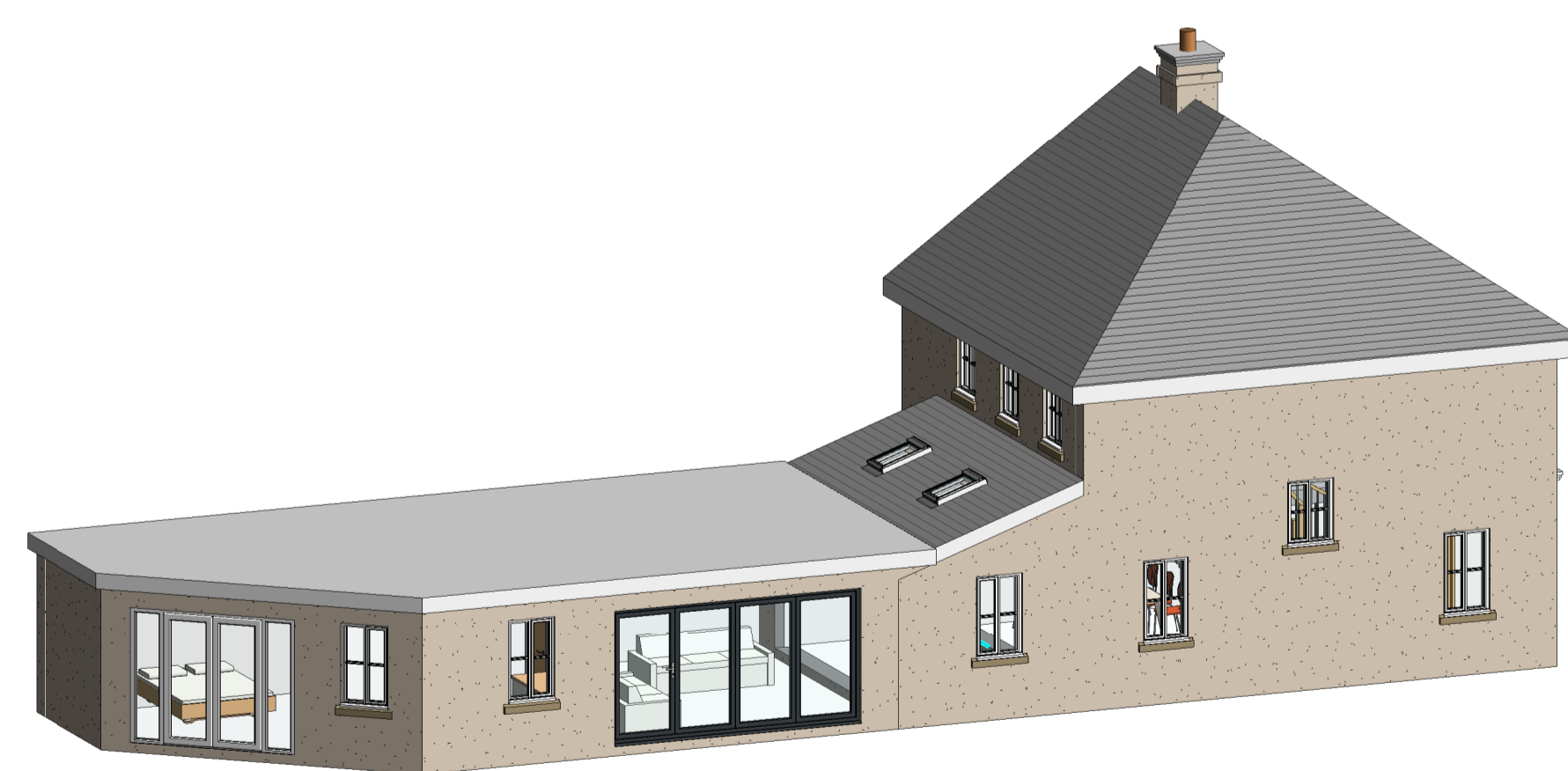
3D View - Proposed