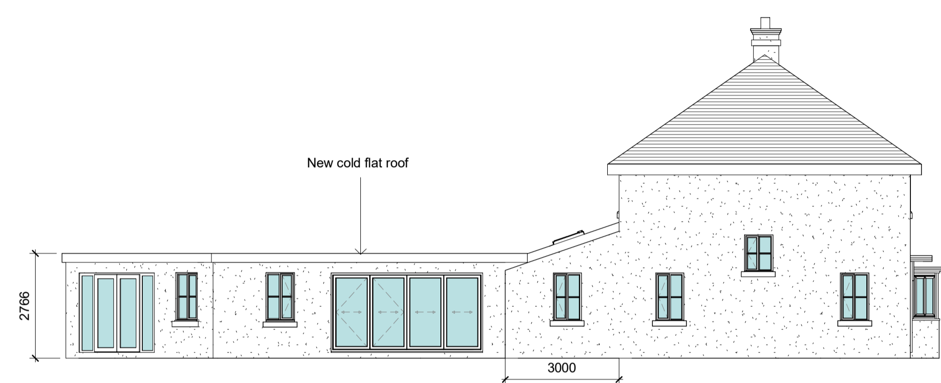
South Elevation - Proposed 1 : 100