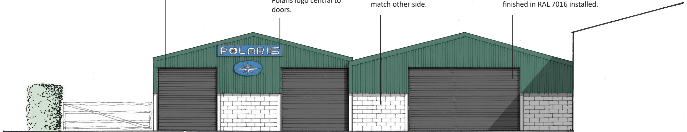
North Elevation as Proposed

Existing opening to be reconfigured with new steel frame and 6m wide roller shutter door finished in RAL 7016 installed.