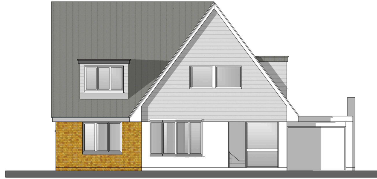
ELEVATION AS PROPOSED TO STAGBOROUGH WAY (EAST)