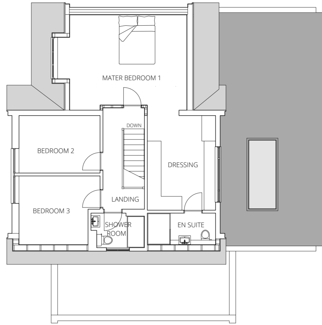
PLAN AT FIRST FLOOR AS PROPOSED