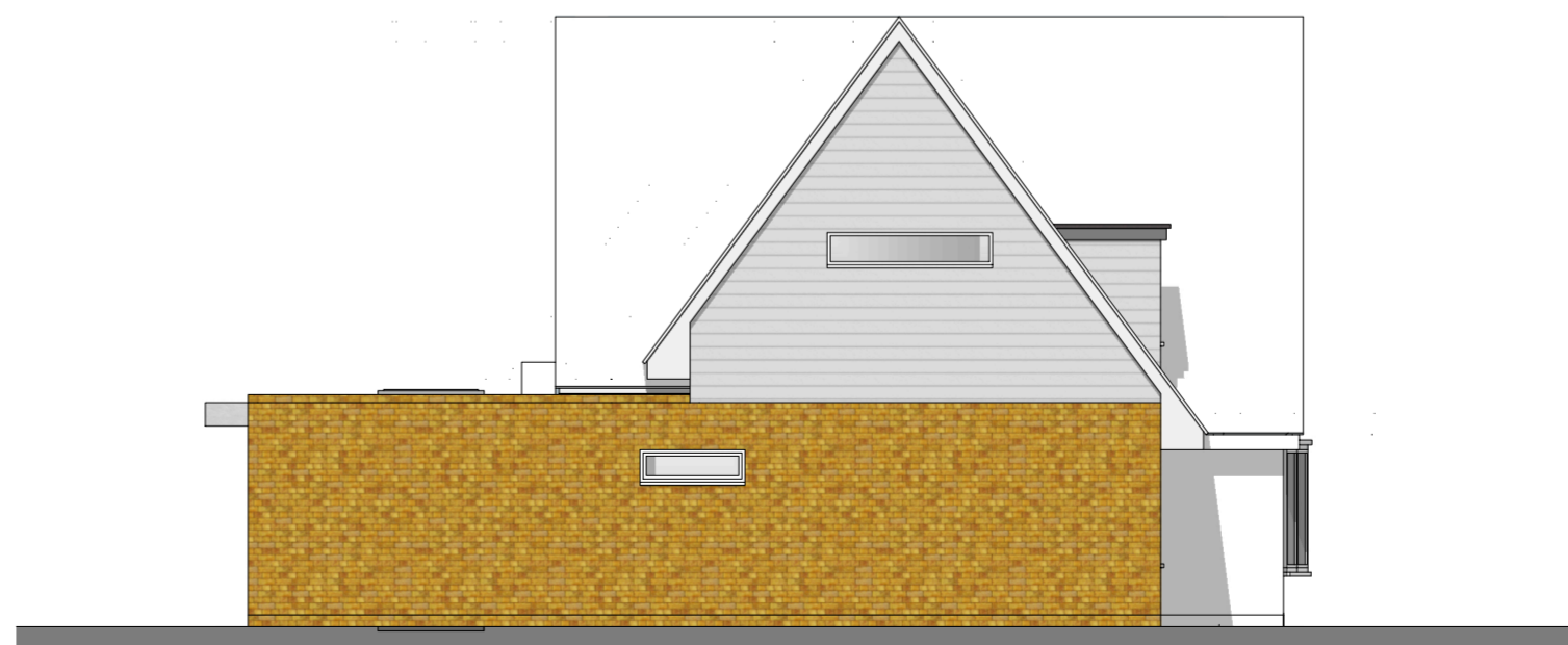
ELEVATION AS PROPOSED TO ALMOND WAY (SOUTH)

Client Mr P Mitchell Project Householder Application for a single storey rear extension, two storey side extensions, existing dormer extensions and internal remodelling at 75, Stagborough Way, Stourport on Severn, DY13 8TX