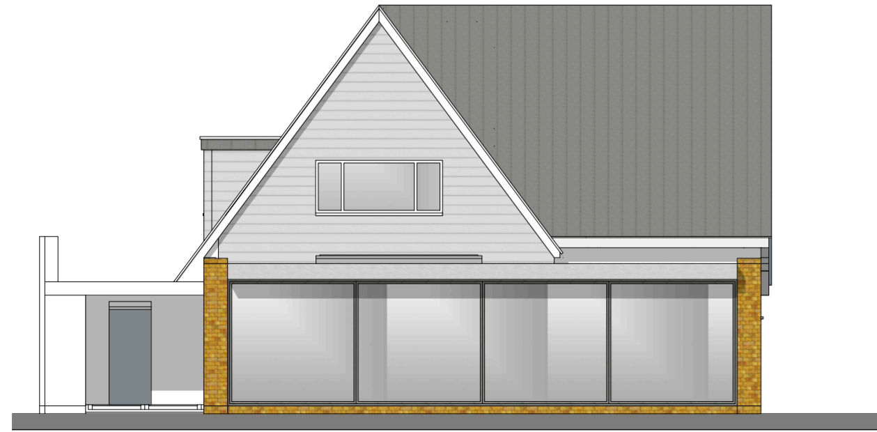
ELEVATION AS PROPOSED TO REAR GARDEN (WEST)