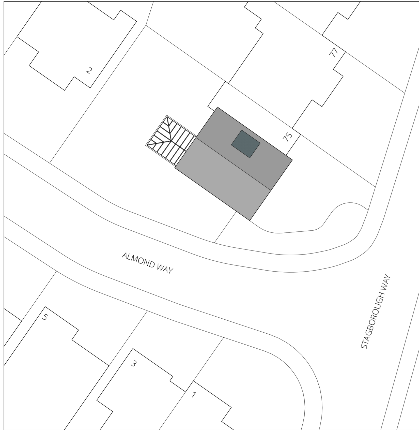
BLOCK PLAN AS EXISTING