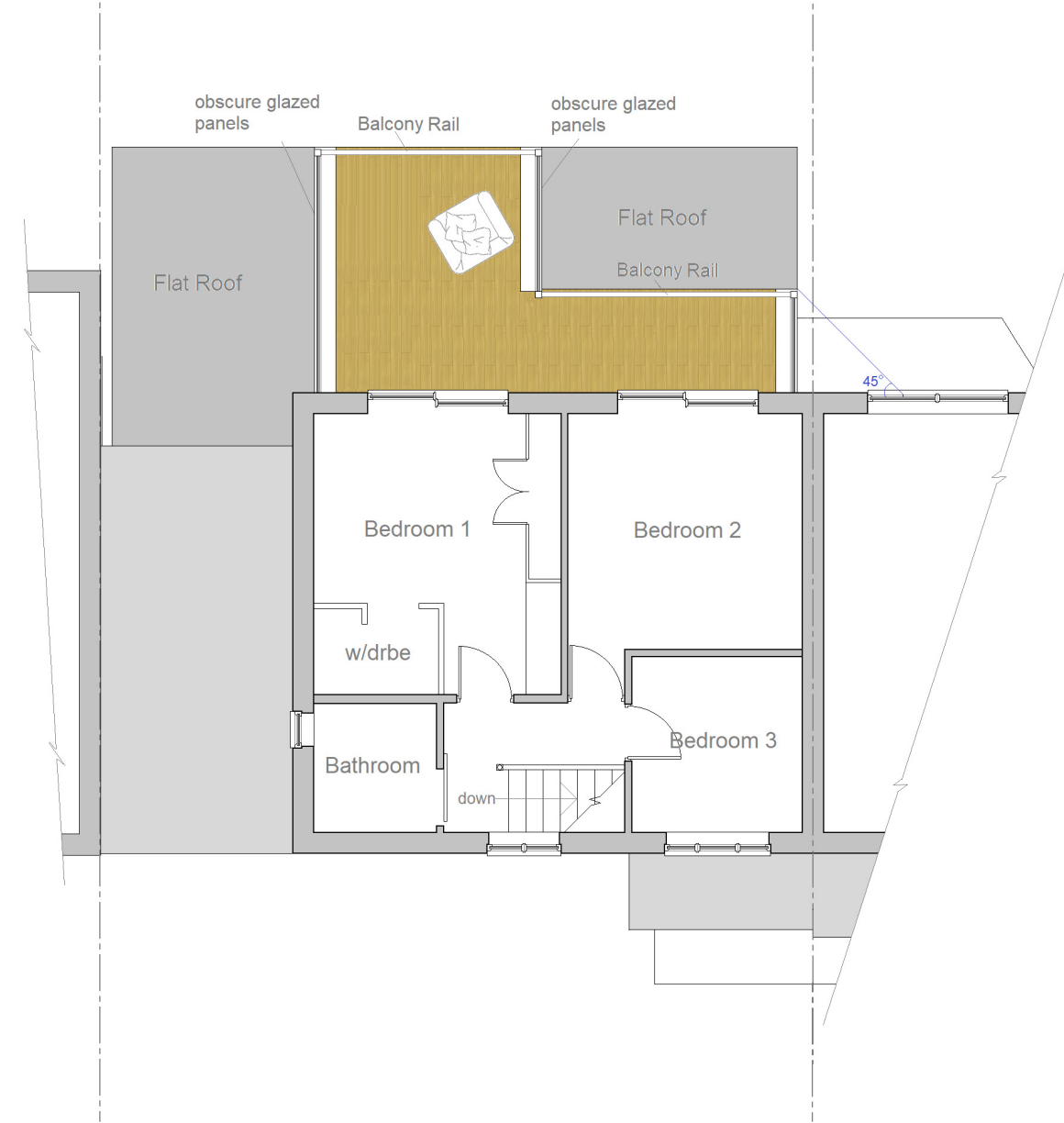
Proposed First Floor Plan 1:100 @ A3