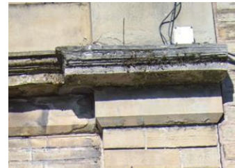
Building 3 – Buttress and Moulded String