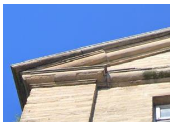
Building 1 - Cornice and Pediment