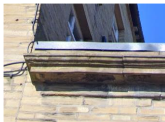
Building 2 – Gate Coping