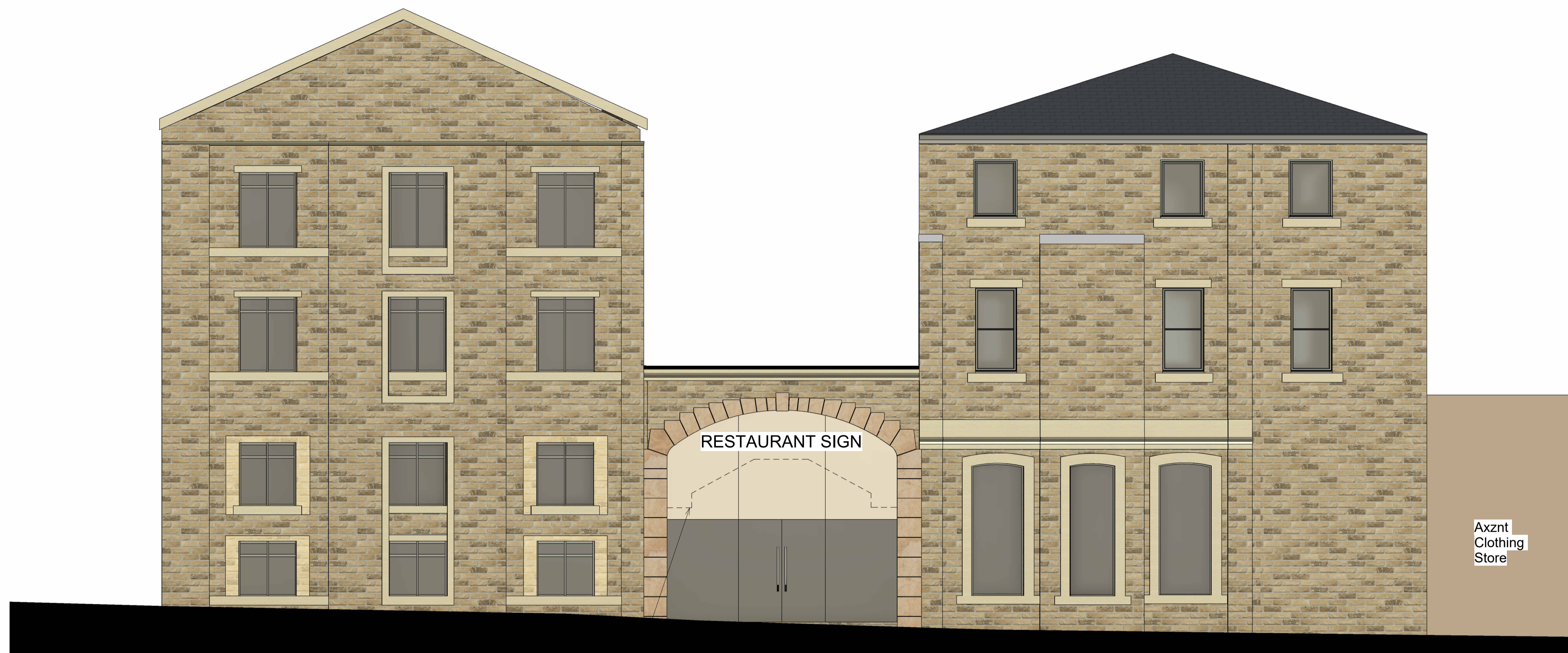
1 Proposed Front Elevation 1 : 50