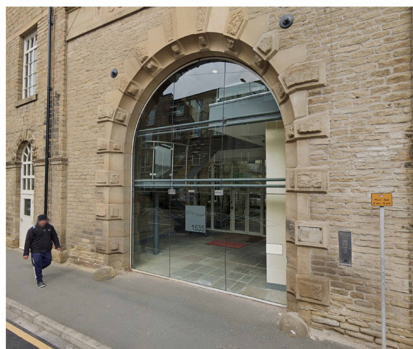
Example Image for Door