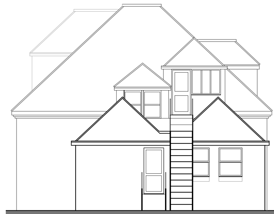
Existing Rear (South-East) Elevation