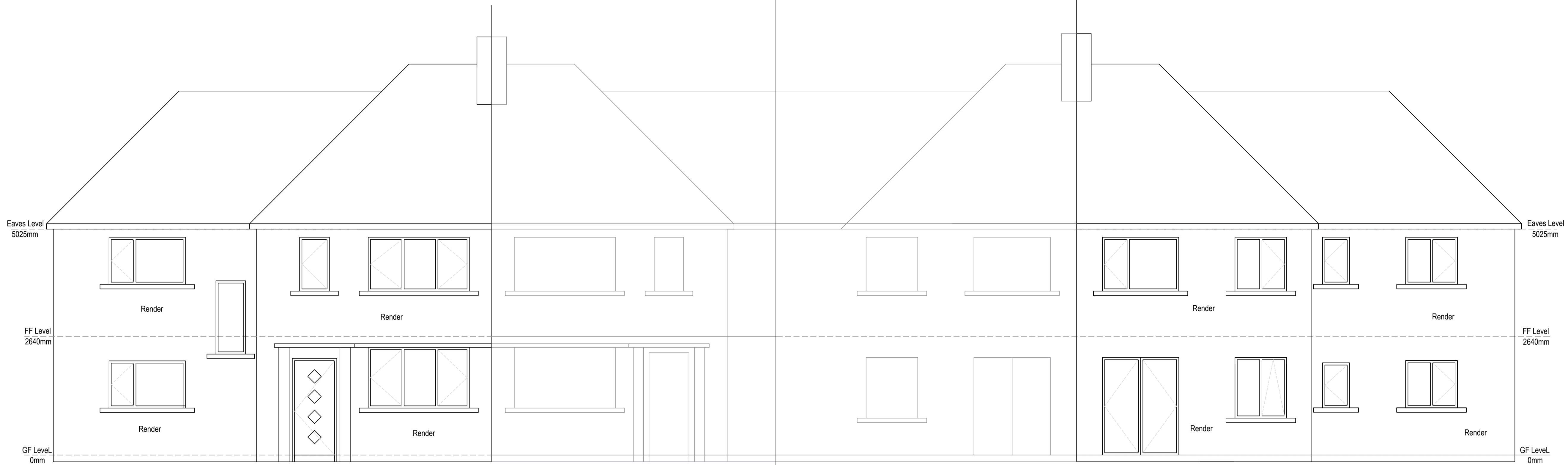
Existing Front Elevation 1:50