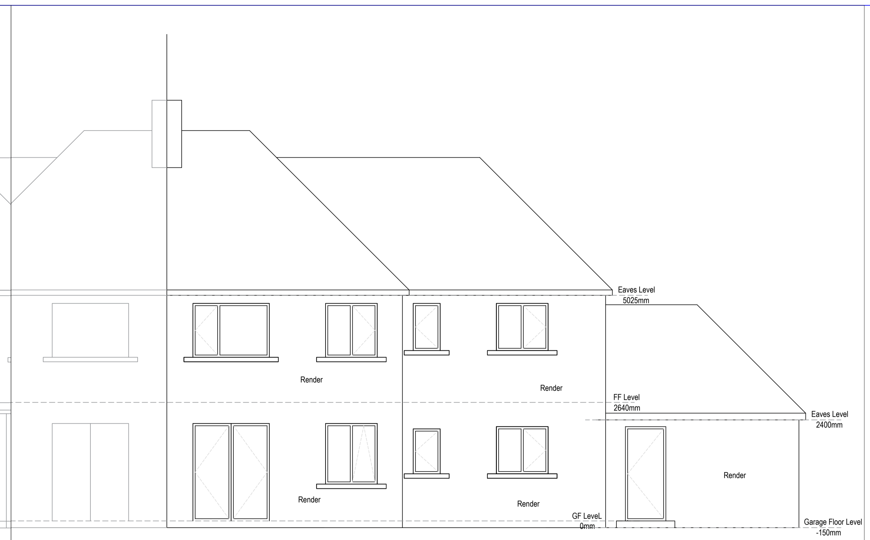
Proposed Rear Elevation 1:50