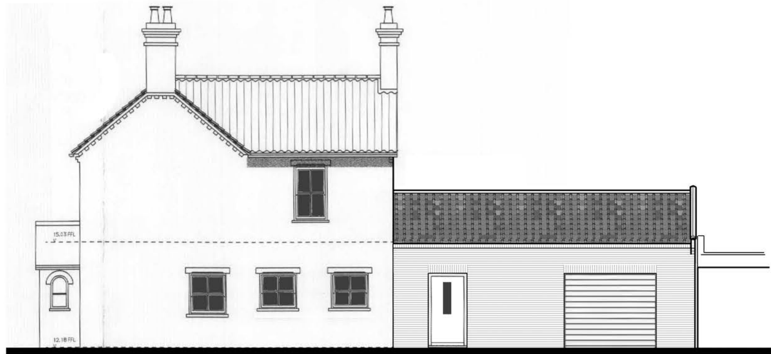
:: North West :: Existing :: 1:100 at A3 ::