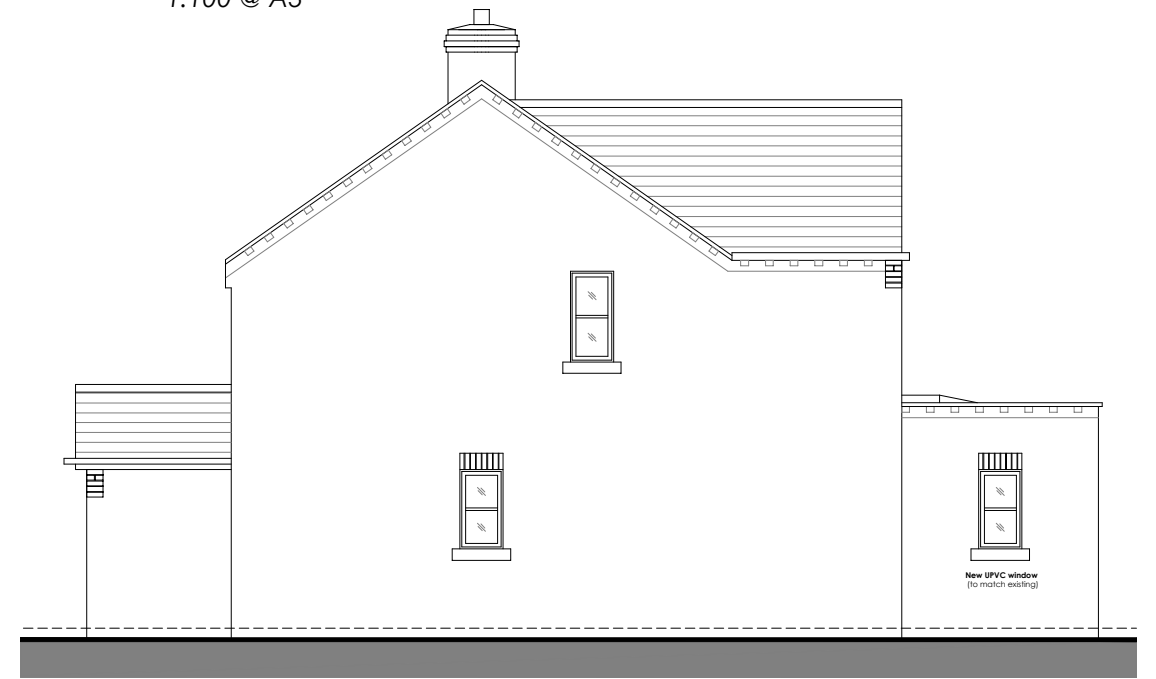
Proposed West Elevation