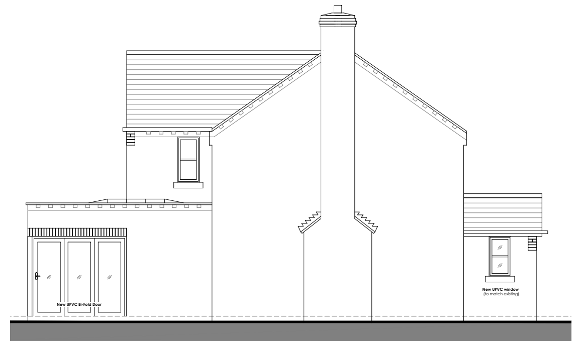
Proposed East Elevation