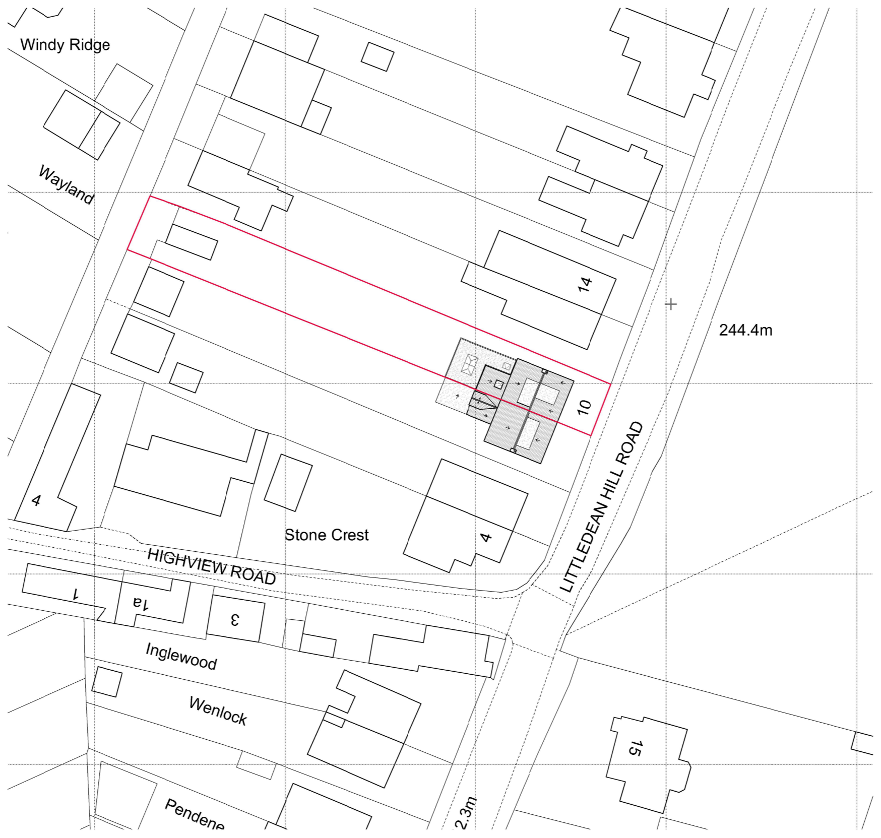
Proposed Block Plan 1:500