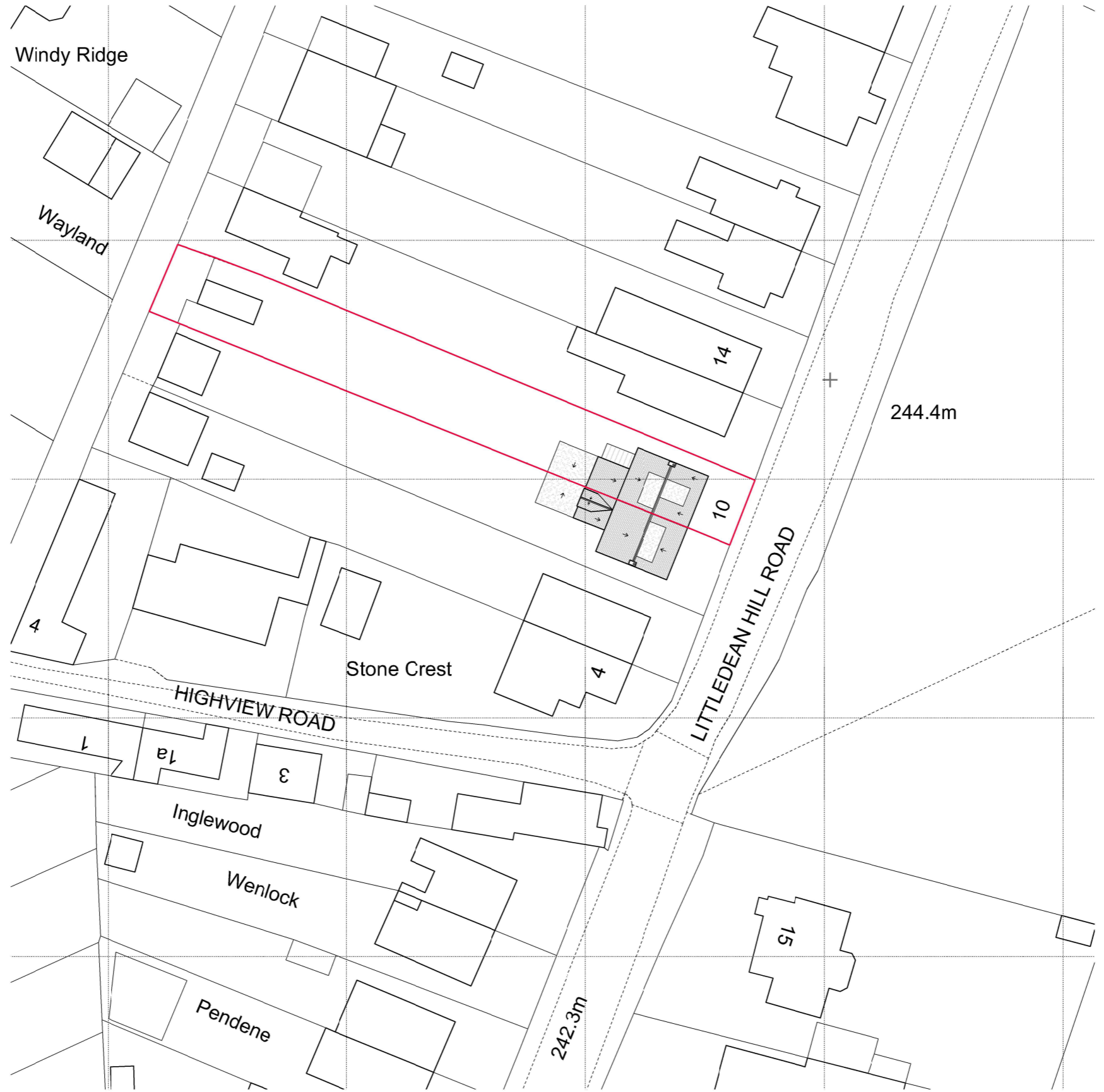
Existing Block Plan 1:500