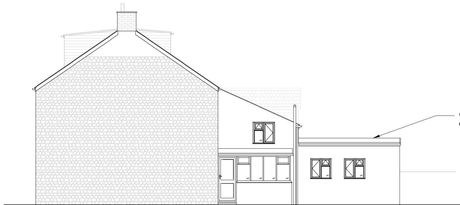
Existing North East Elevation (Rear) 1:100

WC and single storey part of kitchen to be demolished