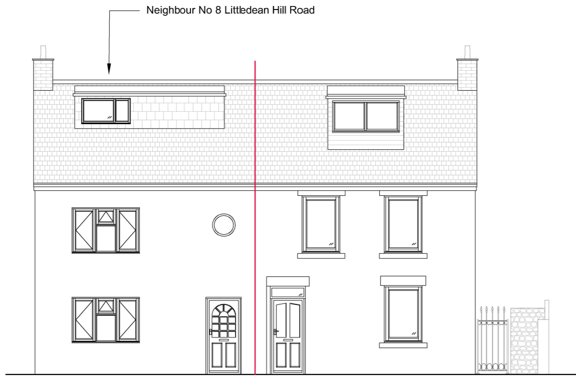
Existing South East Elevation (Front) 1:100