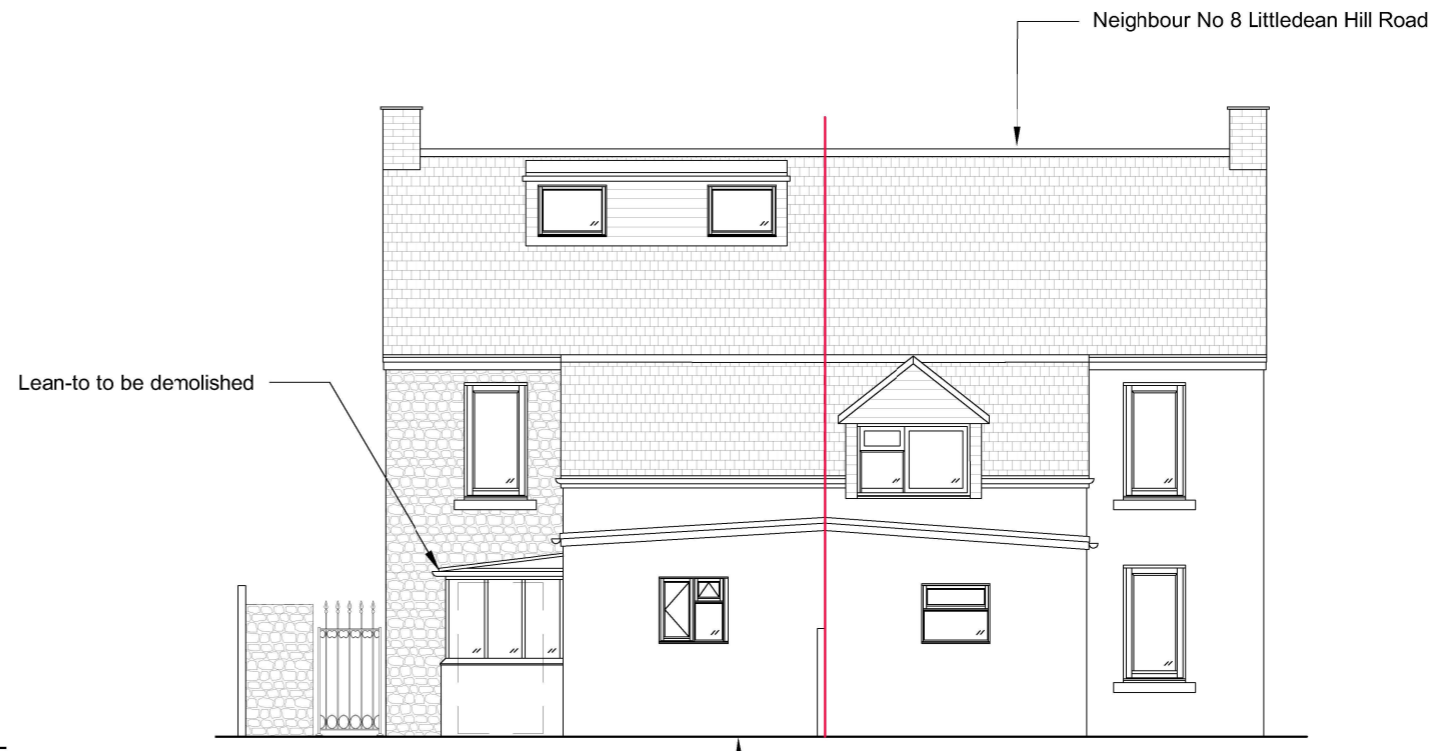
Existing North West Elevation (Rear) 1:100