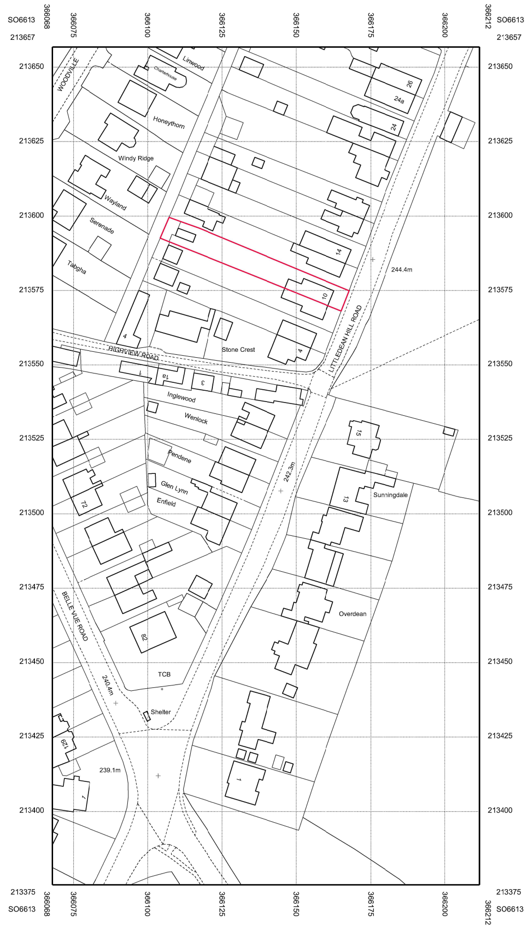
Site Location 1:1250